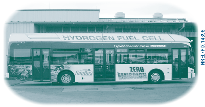
This fuel cell bus is being demonstrated at SunLine Transit Agency.

is a joint powers authority that provides public transit and community services to California's Coachella Valley. Headquartered in Thousand Palms, California, SunLine's service area encompasses more than 1,100 square miles and includes nine member cities (Desert Hot Springs, Palm Springs, Cathedral City, Rancho Mirage, Palm Desert, Indian Wells, La