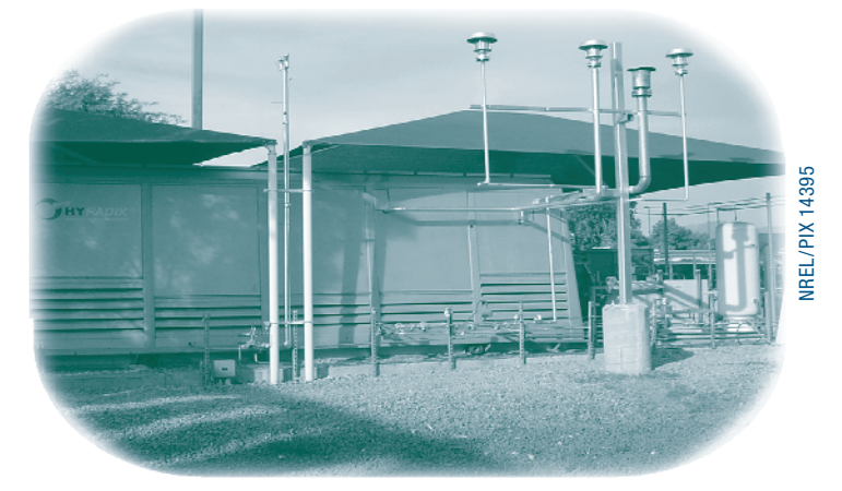
A natural gas autothermal reformer by HyRadix produces hydrogen for the fuel cell bus at SunLine.

ISE designed the system to be flexible. Depending on a client's needs, a variety of powerplants and energy storage