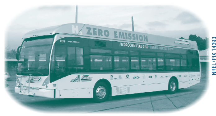
The buses at AC Transit have UTC Power fuel cell and ISE hybrid electric drive systems.

(AC Transit) provides transportation services to a 360-square-mile service area that includes 13 cities and adjacent unincorporated regions in Alameda and Contra Costa counties. Based in Oakland, California, AC Transit's fleet features 679 vehicles (standard and articulated buses, coaches, and paratransit vehicles), which