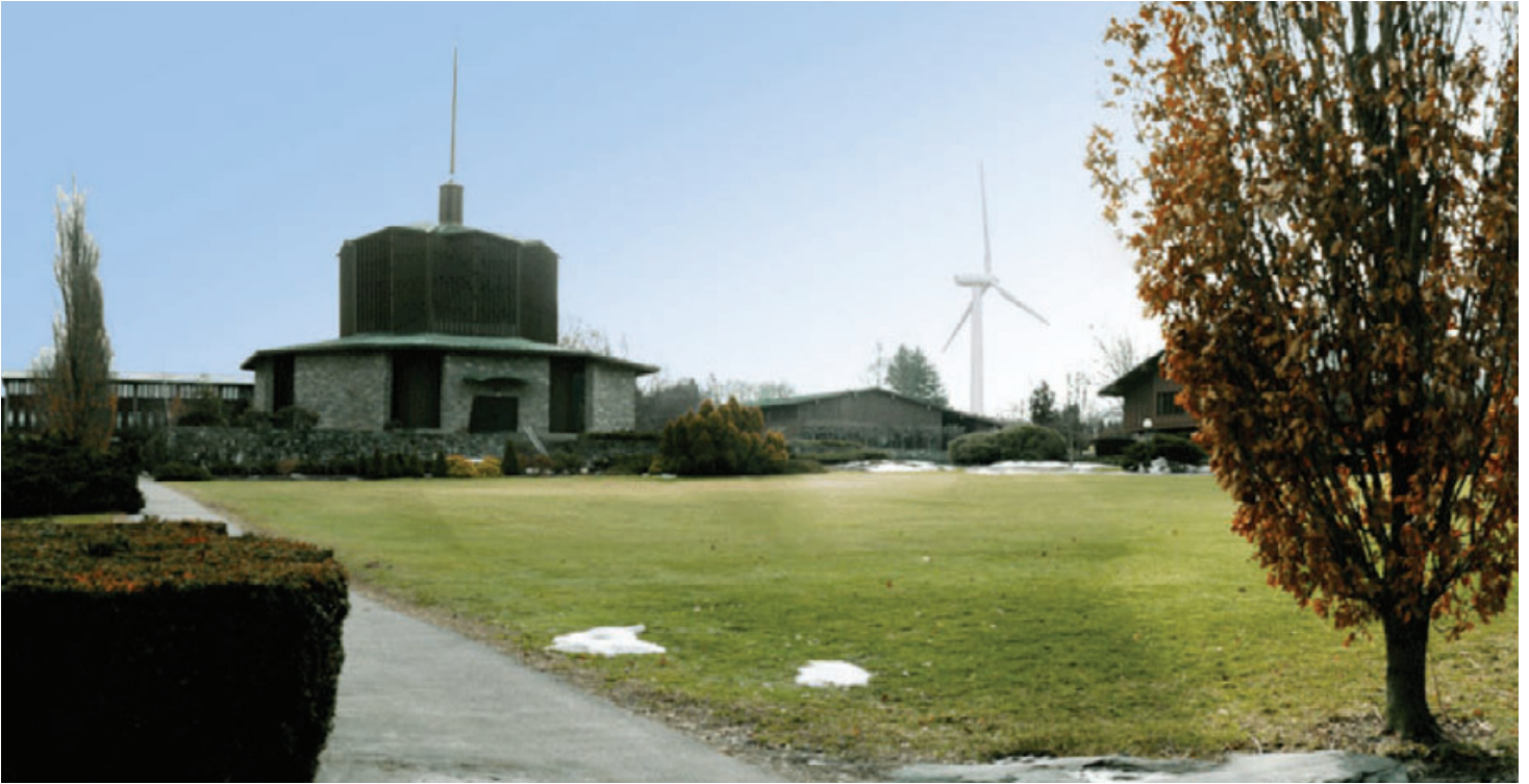
Photo simulation of Vestas V47 viewed from the center of campus, Holy Lawn, Portsmouth Abbey School, Portsmouth, RI.

renewable energy source was a good idea. It made sense economically. The questions were: How big? What does it look like? Where will we put it? It is a very big thing and will undoubtedly dominate the landscape. It will be set back about 1000 feet from the closest neighbors on Cory's Lane, almost directly behind the Monastery and the Church. Right from the very beginning we talked with our neighbors and others in the town to get their input. The response was overwhelmingly positive. We're putting it on a beautiful property, and we have an obvious sensitivity to aesthetics. Our hope is that if we are willing to put something this big on that property, it may quell the NIMBY arguments against wind power. We have a hockey rink on the campus, with a lot of people going in and out, so the turbine will be a real showcase. It will also be like a giant weather station, with interesting educational applications... we can tap into the data feed from the turbine 24 hours a day, and we can make that available to other schools as well.