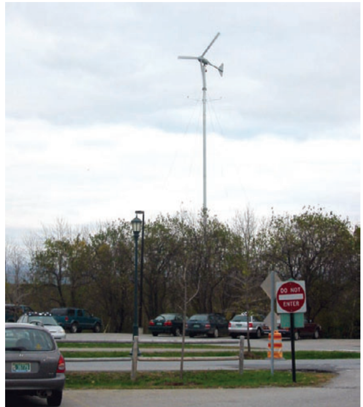
A 10-kW Bergey wind turbine installed at the University of Vermont campus in Burlington.

Massachusetts supports small wind through a Massachusetts Technology Collaborative small renewable energy initiative, as well as funding schools to assess their wind power potential through their green buildings programs. MTC's small renewables initiative made three awards this year for 10-kW or smaller turbines. The first, a 1.7-kW African Wind Power 3.6 turbine,