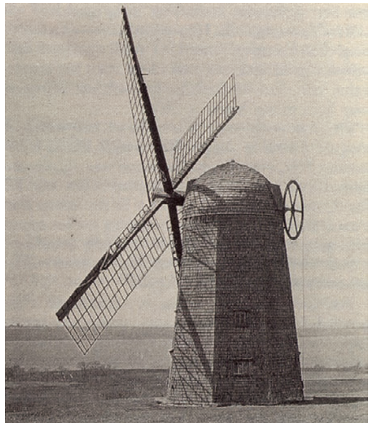
Sherman Grist Mill c. 1900 on the site of what is today Portsmouth Abbey School, Portsmouth, RI.

The Abbey’s monastery and school are located on a beautiful 200-acre property. Everyone’s biggest concern was, “What will this look like?” Everyone thought that wind as an alternative and