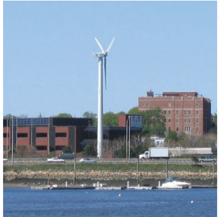
Fuhrlander FL100 wind turbine at the IBEW Local 103 headquarters, Dorchester, MA

Catamount Energy's Glebe Mountain project, envisioned as a 27-turbine wind farm in Londonderry near Magic Mountain, has run into some snags. The Londonderry Select Board voted on October 17 to adopt the Londonderry Planning Commission's new Town Plan that prohibits large-scale wind generation facilities within the town's Resource Conservation Overlay District, which includes the proposed Glebe Mountain site. In a newspaper interview, Catamount Engineering's managing director indicated disappointment but vowed to pursue the project despite the vote.