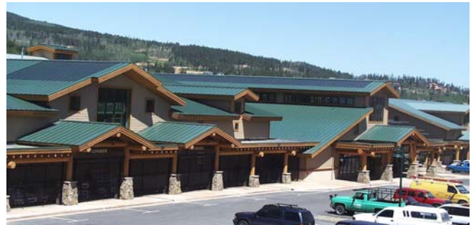
Figure 3. Bighorn Home Improvement Center

The BigHorn Home Improvement Center in Silverthorne, Colorado, consists of an 18,400-ft 2 (1,710-m 2 ) hardware store retail area and a 24,000-ft 2 (2,230-m 2 ) warehouse (Figure 3). The owner was committed to minimizing energy use in his building. Natural ventilation provides all the cooling loads, which was enabled by reduced internal gains from lighting and envelope design. The lighting load is reduced by extensive use of daylighting. The retail area uses a hydronic radiant floor system with natural gas-fired boilers. An energy management system controls the lights, natural ventilation, and heating system. A transpired solar collector and gas radiant heaters heat the warehouse.