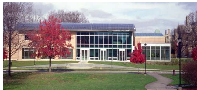
Figure 1. Oberlin College Lewis Center

These results show that a high-performance academic building is possible in a climate that has heating loads, cooling loads, and humidity, such as in northern Ohio. A zero-energy building in this climate will be very difficult to realize, especially with on-site wastewater treatment loads. Additional PV capacity that extends beyond the footprint of the building and better control algorithms would be required to meet the zero-energy vision with today's technology.