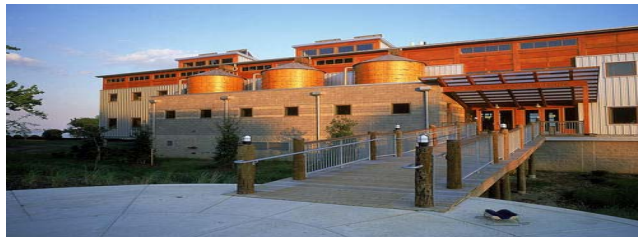
Figure 6. CBF’s Philip Merrill Environmental Center

The Chesapeake Bay Foundation (CBF) built the 31,000-ft 2 (2,900-m 2 ) Philip Merrill Environmental Center in Annapolis, Maryland, to serve as the foundation headquarters (Figure 6). Early in the design