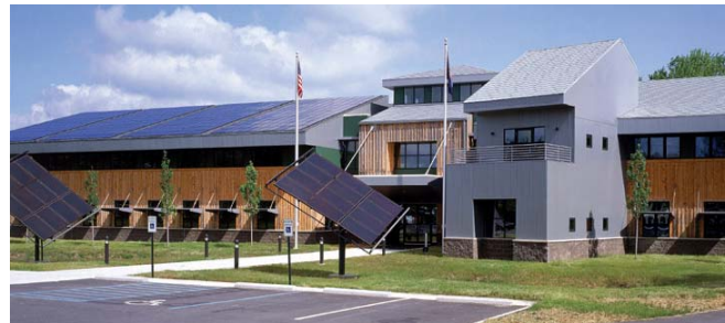
Figure 5. Cambria Office Building

The integrated energy design of this all-electric building produced an energy saving of 40% and energy cost saving of 43% compared to Standard 90.1-2001. The lighting and HVAC efficiencies contributed most to the energy saving. Some daylighting was used, but the energy saving was minimal. The PV system covers about 40% of the roof and provides approximately 2.7% of the annual energy. Operational problems with the PV system have been corrected and the energy production is expected to double.