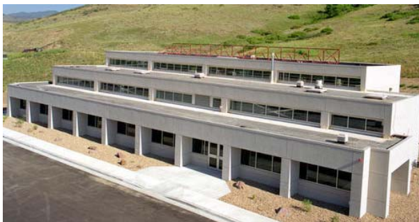
Figure 4. NREL Thermal Test Facility

The NREL Thermal Test Facility (TTF) in Golden, Colorado, is a 10,000-ft 2 (930-m 2 ) steel frame building typical of many small commercial buildings, such as professional buildings, industrial parks, and retail spaces. The building features extensive daylighting through clerestory windows, two-stage evaporative cooling, and overhangs for minimizing summer gains, T-8 lamps, instantaneous water heaters, and a well-insulated thermal envelope (Figure 4).