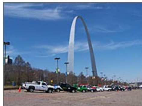
Vehicles involved in Drive Clean and Green Across Missouri on display at the St. Louis Arch.

The St. Louis and Kansas City coalitions teamed up with the Missouri Department of Natural Resources to sponsor, "Drive Clean and Green Across Missouri," a three-day event designed to introduce Missourians to advanced technology and alternative fuel vehicles (AFVs). The event, which featured a caravan of hybrid electric and gaseous bi-fuel vehicles, as well as those that run on E85 and biodiesel, began in St. Louis April 5 and ended in Kansas City April 8--a 664-mile trip.