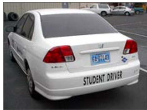
Tucson-area students learn to drive in CNG Honda Civics.