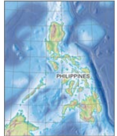
Map of the Philippines. Digital Wisdom, Inc.

Few countries have more reason than the Philippines to embrace alternative fuels. This Southeast Asian nation imports more than 98% of its oil, leaving it vulnerable to supply disruptions and price spikes. Eighty-six million Filipinos share a land area slightly larger than Arizona; air pollution in the cities is stifling. For solutions, the Philippines is turning to natural gas, coconuts, and Clean Cities.