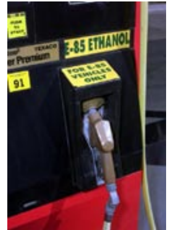
The E85 Fleet Toolkit helps fleets install ethanol pumps like this.