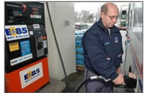
A Northland District letter carrier fills up his FFV with E85 at a nearby fueling station.

Asked to give advice on establishing a successful alternative fuel program, Kunowski emphasizes the importance of an accurate fuel use tracking system. "You have to have good facts and data to make good decisions," he says. He also stresses educating managers and staff on E85 goals and procedures and designing the program to be cost effective. "You need to balance the cost with the environmental benefits of alternative fuels," says Kunowski. "And remember, we only get one environment."