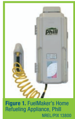
Figure 1. FuelMaker's Home Refueling Appliance, Phill NREL/PIX 13800

A team was assembled by DOE's National Renewable Energy Laboratory to conduct the safety evaluation of Phill. Various investigations and analyses were used to generate data for accurate safety incident probability calculations. References and databases pertaining to component failure and human error statistics were used. CNG vehicle refueling experience was surveyed to determine which kinds of accidents have occurred in the past. CNG vehicle fuel system designs were analyzed to support estimation of gas releases from vehicles. Experience with water heaters and other garage-installed natural gas