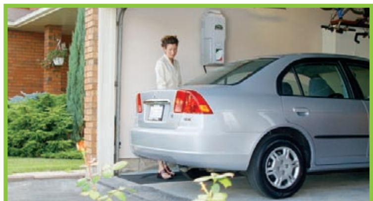
Figure 2. Phill Provides CNG Refueling inside Residential Garages NREL/PIX 13714