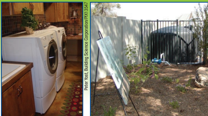
From the inside—H-axis clothes washer—to the outside—rainwater cisterns—this home is a water miser.