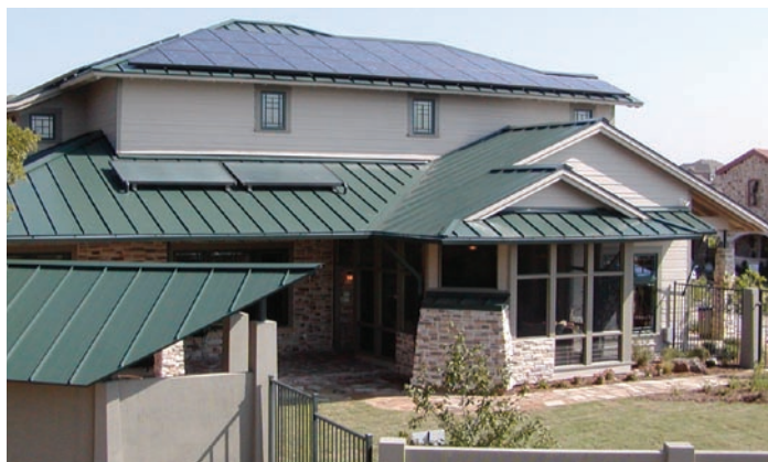
Great unobstructed southern exposure for the photovoltaic and solar water panels, the “engines” of this Zero Energy Home.

See the North Texas Zero Energy Home analysis on the Building Science Corporation Web site at www.buildingscience.com for more detailed information and discussion on the energy performance of this home.