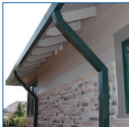
Durability is all in the details—wrap-around overhangs, recessed windows, fibercement siding and trim, gutters, bath exhaust vents.