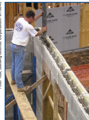
The wood fiber-cement block was selected for its ability to handle moisture in the building enclosure.

engineered wall assemblies, and painstaking attention to moisture control details.