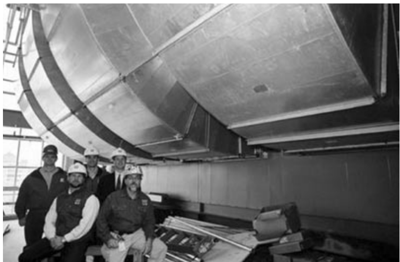
The design and planning team in the mechanical penthouse of Building 50, a new research laboratory in the National Institutes of Health campus in Bethesda, Maryland. Behind the team are supply ducts for the building's air handler.

If only the regulated loads in American Society of Heating, Refrigerating, and Air-Conditioning Engineers (ASHRAE) standard 90.1 are considered, the percentage of energy savings is even higher. Implementing low-pressure-drop design strategies established in the early stages of the design process will result in much lower energy costs throughout the system's life. First costs, however, typically will increase, because of such factors as the need for additional mechanical room space and larger duct shafts and plenums. But these increases can be mitigated by the decreases in first costs resulting from the designers' subsequent ability to reduce the size of fans and motors, specify duct construction details (low vs. high pressure), and eliminate sound attenuators.