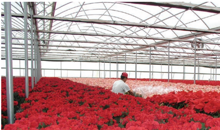
Milgro Nurseries geothermally heated greenhouses near Newcastle, Iron County

The Utah Geological Survey maintains a geothermal web site for Utah ( www.geology.utah.gov/geothermal ) and recently released Open-File Report 431,