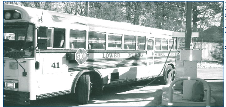
Lower Merion Bus Being Refueled

The Lower Merion School District serves this Township as well as the Borough of Narberth, a 1-1/2 square mile town of 1,900. The school district aggressively cultivates its image as a progressive educational institution. Lower Merion offers one of the lowest tax rates in Pennsylvania and one of the highest per-pupil expenditures in the state. A total of 6,598 students attend the six elementary schools, two middle schools, and two high schools within the district.