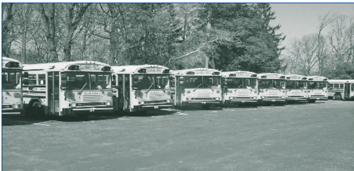
Lower Merion CNG Buses

The school district would like to eventually convert its entire fleet of 79 school buses and 30 operational support vehicles to natural gas.