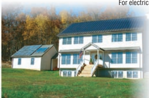
U.S. Department of Energy