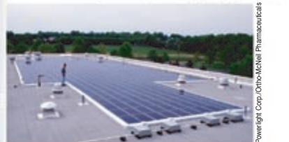
PowerLight Corp./Orino-McNeil Pharmaceuticals