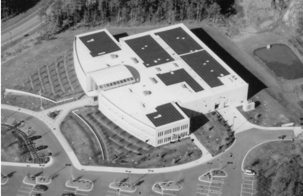
A rooftop photovoltaic (PV) system produces electricity on site at the Environmental Protection Agency's facility in Research Triangle Park, North Carolina.

This guide to on-site power systems is one in a series on best practices for laboratories. It was produced by Laboratories for the 21st Century (“Labs 21”), a joint program of the U.S. Environmental Protection Agency and the U.S. Department of Energy. Geared toward architects, engineers, and facility managers, these guides provide information about technologies and practices that can be used to design, construct, and operate safe, sustainable, high-performance laboratories.