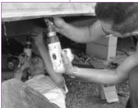
Virginia crew insulates the belly of a mobile home to increase energy efficiency.