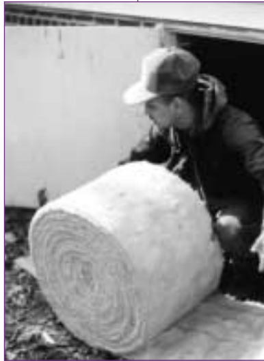
Weatherization worker prepares to install insulation in a low-income home.

By reducing demand for energy, weatherization also avoids harmful emissions from residential buildings and power plants. This improves local air quality and reduces related health effects, particularly asthma. In addition, weatherization reduces annual emissions of carbon dioxide, a leading greenhouse gas, by an average of one metric ton per weatherized home. For a densely populated city with heavy traffic congestion like Washington, D.C., mitigating harmful emissions is particularly important.