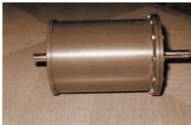
Flow rate = 1000 Barrels/day; 8 inch Diameter 6-30 ppm oil in water; 40-80 ppm water in oil - measured at design point

The RST3 system weighs less than one-tenth that of a typical gravity three-phase separator and it creates its own source of clean power.