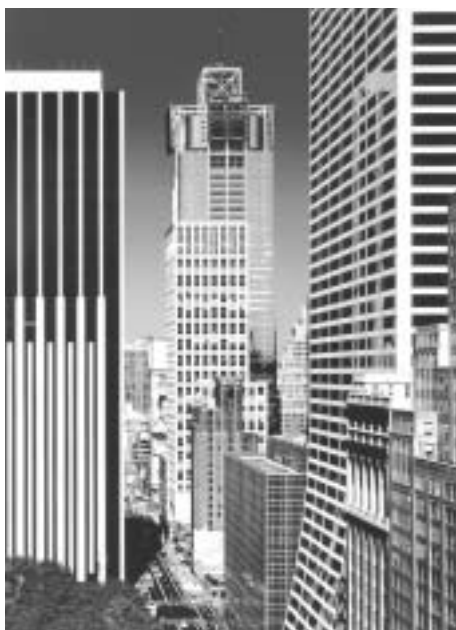
An example of Building-Integrated PV is 4 Times Square in New York City.

During the previous phase of the time line, Project Planning, basic decisions were made regarding site placement, plan organization, and building massing. Those determinations will now influence the basic low-energy design