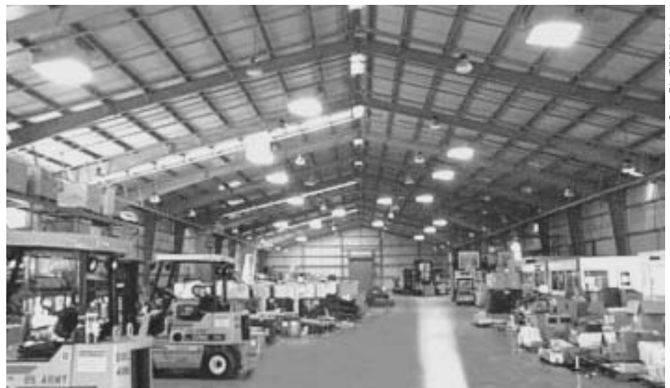
Daylighting retrofits for U.S. Army warehouse in Hawaii.

Comments: The best way to evaluate the lighting effects of window geometry and configuration is through computer analysis, using programs such as RADIANCE.