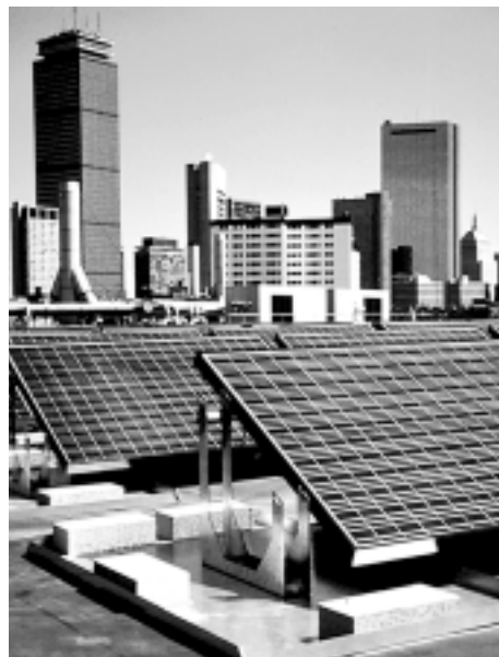
Boston Edison joined Northwestern University to use solar electricity to power the Ell Student Center on the University's Boston campus. The rooftop PV system incorporates 90 285-W p modules installed on innovative ballasted mounting trays that require no roof penetration.

As a result, many of these buildings include or consist of towers that shade and are shaded by neighboring buildings, a factor that may significantly