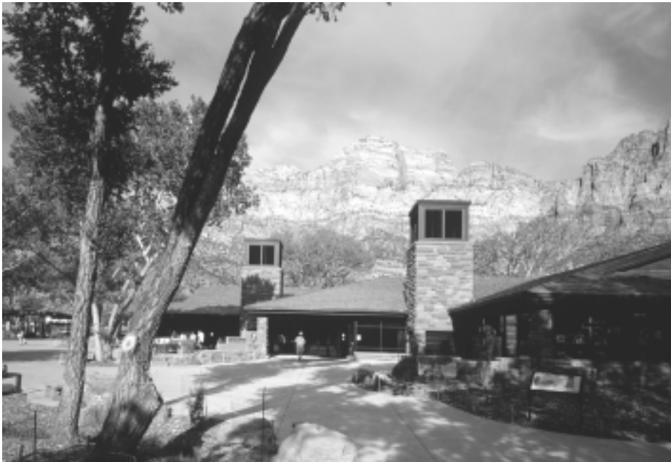
The Zion Visitor Center is designed to use 70% less energy than a typical building without costing more to build.

(either hot or cold) climates inaccessible to utilities; they have a natural connection with the outdoors; and the structures present an opportunity to interpret the resource-conservation mission of the agency to the visiting public. These structures typically combine a need for window area, massive construction, and a tolerance for temperature swings—all of which are highly compatible with low-energy building design. Daylighting is another key strategy for deployment in these building types.