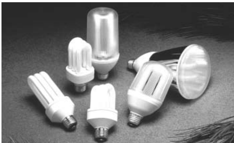
Some examples of energy-efficient lamps.

How to Do It: There are various types of efficient heating and cooling equipment that can readily address the specific needs and operating patterns of a given building. Many agencies require that alternate systems be subjected to a life-cycle cost analysis. If such an exercise is conducted, it should involve detailed computer analysis (such as DOE 2.2) rather than a process that simply confirms the selection of a preferred system. Ask the design team to prepare a list of performance criteria for equipment required by applicable codes and standards to be used as a basis for comparing more efficient equipment options. In some cases, the cost premium for more efficient equipment is small and can be justified by hand calculations. More often, DOE 2.2 computer analyses are required along with some form of rigorous life-cycle cost analysis. Consider using modular equipment (e.g., three small boilers instead of one