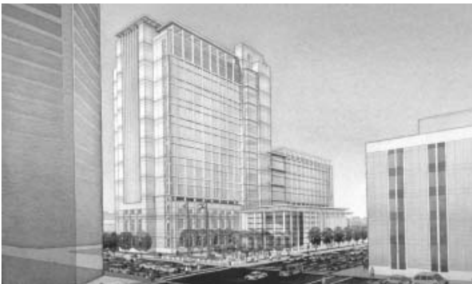
The U.S. Courthouse Expansion in Denver, Colorado, will be a showcase for sustainable building design.

Much of the building's cooling and humidification loads are met using an indirect and direct evaporative cooling system, which provides a cooling effect through water evaporation. This process greatly reduces the need to run an electric-powered chiller. Denver's dry climate makes this system ideal for much