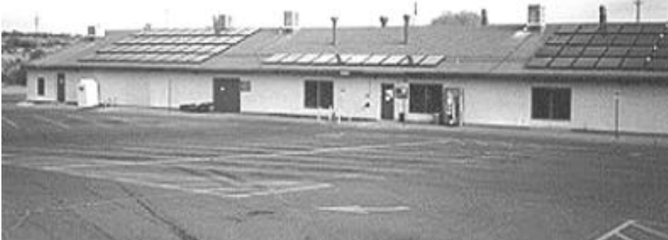
An example of a multi-use building.

loss due to continuous metal contacts throughout the construction. Though not limited to metal components, this process is known as thermal bridging, which can significantly compromise the resistance value of insulation. In climates with hot summers, a white or reflective roof is advisable.