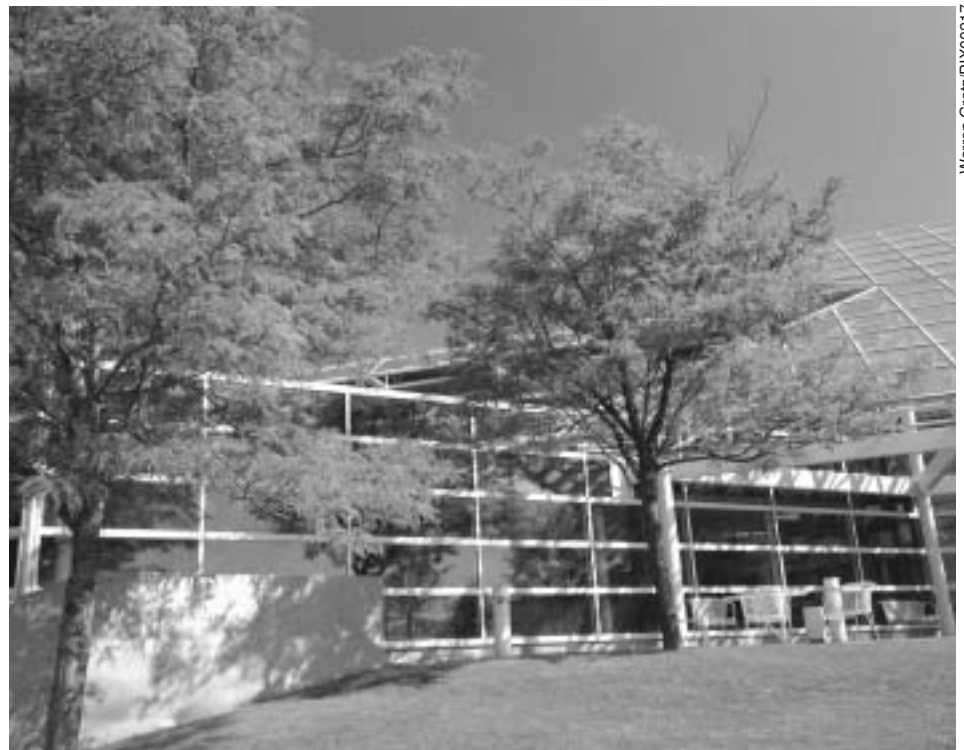
Shade from trees is a simple but effective strategy to reduce costly cooling requirements.

Comments: Daylighting is a central component of the vast majority of low-energy