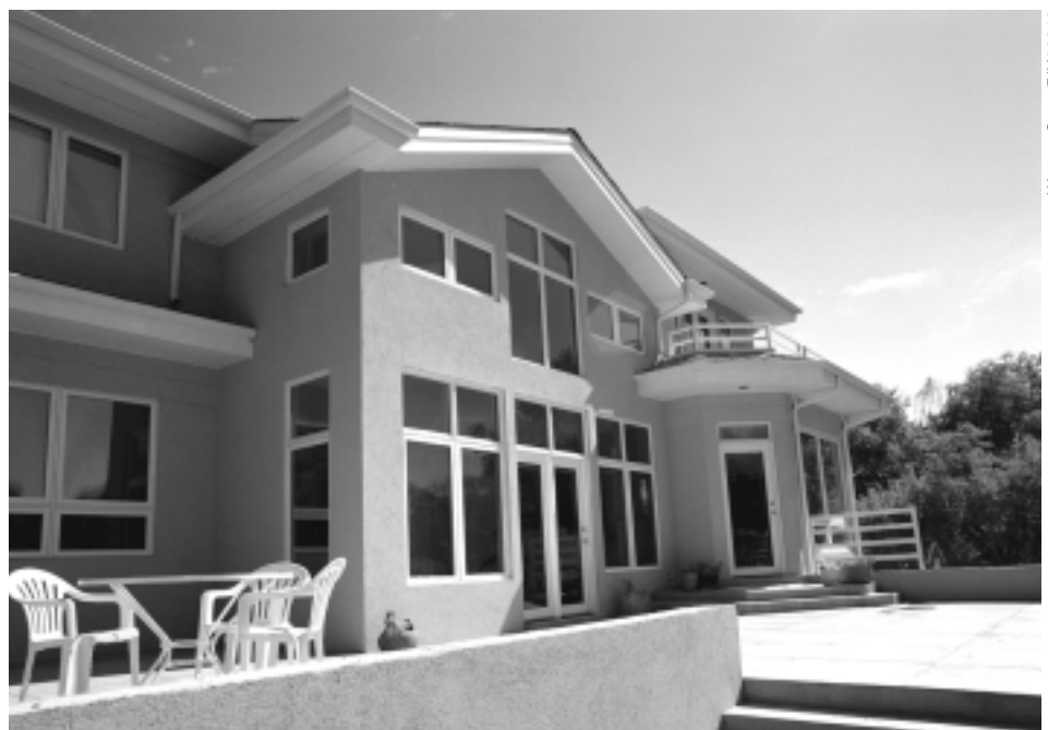
An example of direct-gain passive solar used in a residential building.

Comments: Because true north and magnetic north are different, the design team will need to account for magnetic decli-