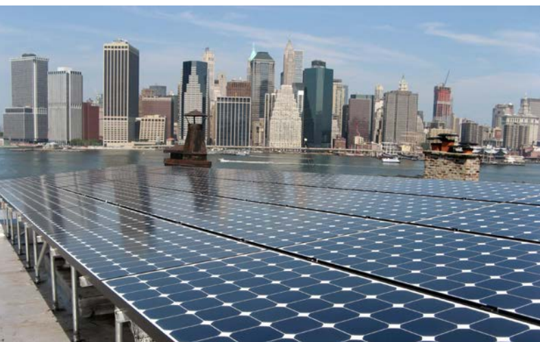
A solar photovoltaic array in New York City provides redundant power for city residents.

A storm and power outage in one location can quickly disrupt the regional supply chain, resulting in significant losses. Climate change can also generate economy-wide risks through disruption to business models, cascading failures from extreme disasters, and increased litigation. Several interviewees noted the importance of considering the ability to anticipate, to prepare for, and to adapt to "changing conditions" in reference to the consequences of climate change as well as the expected changes coming from New York State's clean energy transition. Deep decarbonization will significantly affect specific sectors and the economy as a whole.