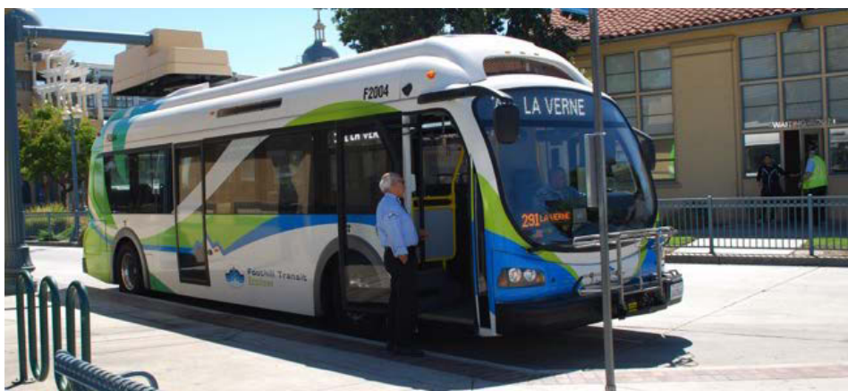
Figure 3. Foothill transit charging station on-route in Southern California, September 2014