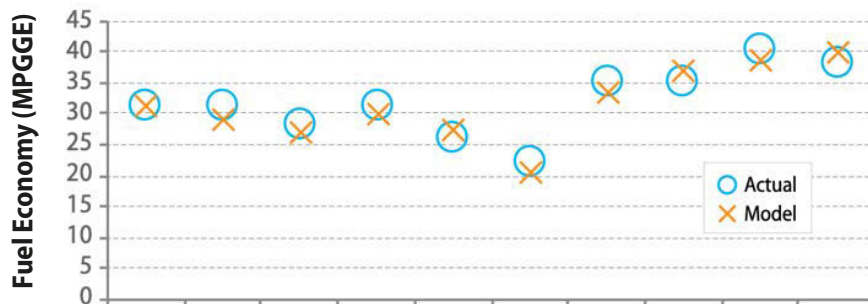
Figure 2. FASTSim sample validation results for a variety of vehicles in Mexico (NREL 2018) Note: Miles per gallon gasoline equivalent (MPGGE) is a measure of the average distance traveled per unit of energy consumed.

differ from the manufacturer's reported performance—including efficiency (kWh/km) and driving range (kWh/day). Also, electric bus scale-up requires significant planning, such as optimal infrastructure, charging equipment, and distribution grid management considerations.