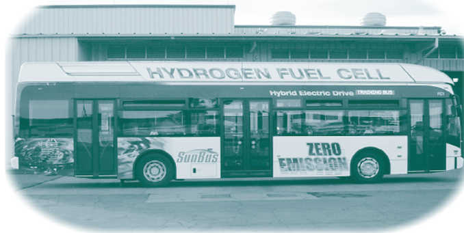
This fuel cell bus is being demonstrated at SunLine Transit Agency.

The prototype fuel cell bus in service at SunLine is the result of a collaboration between UTC Power, ISE Corporation, and