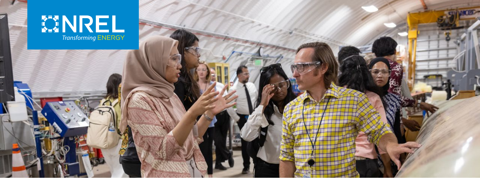
Interns from the Women in Power System Transformation (WPST) program and fellows from Indonesia’s Perusahaan Listrik Negara (PLN) on a tour of NREL’s Flatirons Campus.