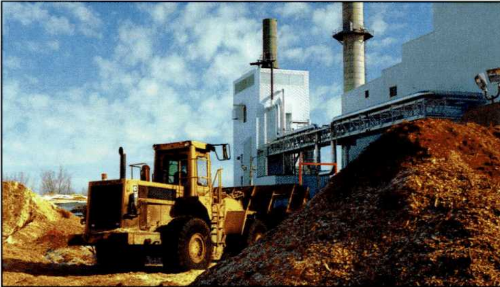
The gasifier at the McNeil Power Generating Station in Burlington, Vermont, can handle up to 200 tons of wood wastes per day.