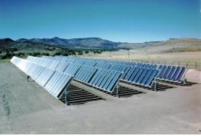
100-kW system at CSW Solar Park in Ft. Davis, Texas.

Under the PVMaT Project, ENTECH worked with key manufacturers to ensure the best possible PV concentrator product. For example, the 3M Company developed a new continuous process for making 90%efficient, ready-to-use lenses, delivered on rolls 200 meters long, reducing materials costs by 20% and eliminating solvent use in ENTECH's module fabrication. 3M also developed a new prism-cover tape for the cells that reduces material and labor costs for that processing step by 90%. Three cell suppliers (BP Solar, ASE Americas, and