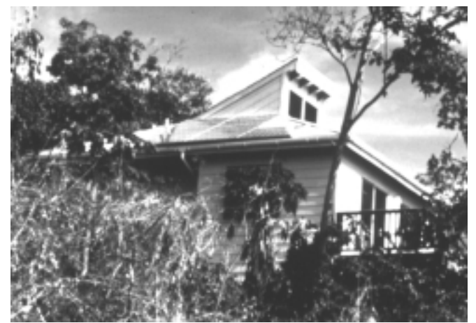
Figure 3. One of the vacation cabins at Harmony Resort on the Island of St. John in the Virgin Islands. The PV unit, which survived Hurricane Marilyn without damage, can be seen on the roof.

Solar hot-water systems and photovoltaic modules are designed to withstand severe environments. PV modules are designed to withstand one-inch-diameter ice balls moving at 23 meters per second (52 miles per hour).<sup>21,22</sup> For maximum survivability, however, solar systems must be attached properly to underlying roof structures using simple but effective techniques that have proven themselves through the years. An excellent example of the survivability of both PV and solar hot-water systems is provided by the Harmony Resort on the