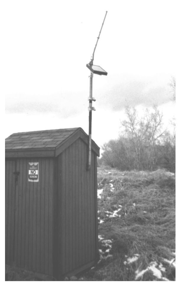
Figure 1. A PV-powered water-level monitor protects the City of Ft. Collins, Colorado, from floods by continually monitoring stream flow and radioing data to the city center. Alarms are triggered if the stream rises to dangerous levels, and emergency response procedures are started.