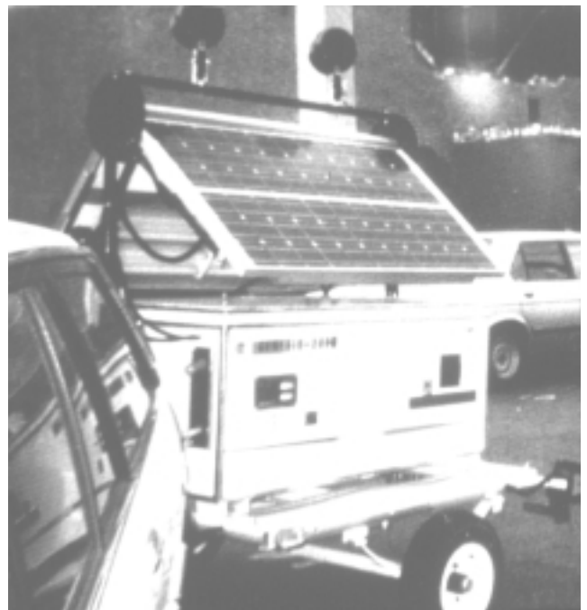
Figure 6. PV gensets come in a variety of sizes that produce up to several kilowatts. This mobile communications and lighting unit was used in the relief effort after the Los Angeles earthquake of 1991 (photo courtesy of Siemens Solar Industries).

Many insurers, including the U.S. Automobile Association (USAA) and CNA,