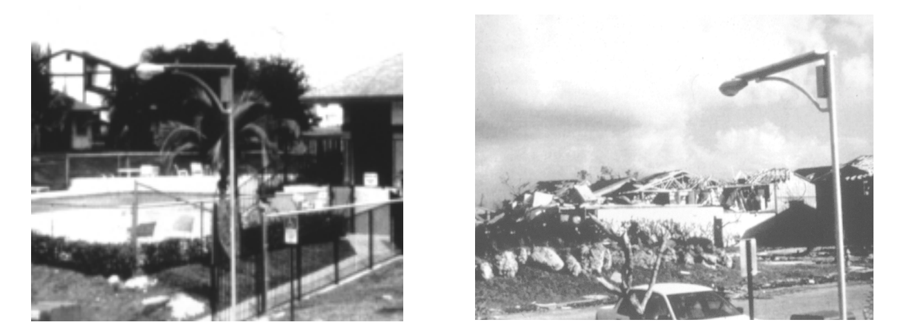
Figure 4. Before and after photos of a PV streetlight in Homestead, a suburb of Miami. Not only were the PV lights the only structures to survive Hurricane Andrew, but they provided the only electricity for several weeks.

An important lesson is provided by one of the PV installations that survived unharmed, but was rendered inoperable because the power line that connected the system to its load was destroyed. Because power lines are very vulnerable to natural disasters, PV is most effective when used as close as possible to the load.