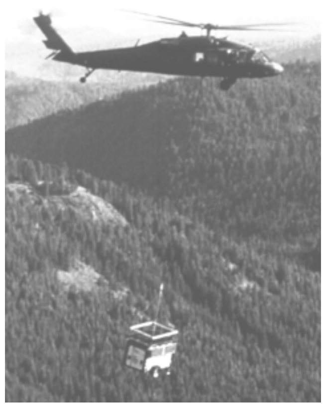
Figure 5. A portable PV genset is helicoptered into the mountains of California.

Since then, PV has been used in a wide variety of emergency management situations. Several companies now make trailer-mounted, PV-powered generator sets ("gensets") up to about two