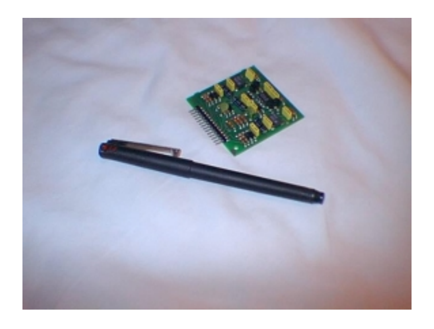
Additional Protection Circuit Added to Production Designs

Application of the hardware based protection circuit developed in Phase I was completed on Trace's existing DR and SW series product lines. This additional protection circuit was phased into full production starting in April of 1997. This improvement resulted in a substantial improvement in factory yields and a very significant reduction of field failures – a drop of as much as 80% on some product models.