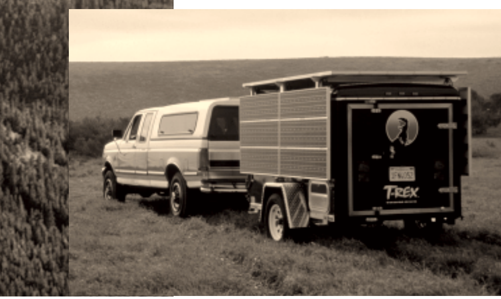
Mobile generators like the "T-Rex" from Live Oak Solar can be transported on the ground or in the air.