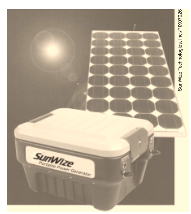
Portable products like this SunWize Power Generator can deliver alternating-current or direct-current electric power; they are easy to transport in a car or a small truck.

Many of these gensets can be ordered by government agencies directly from the General Services Administration (GSA), and they come in a variety of sizes and capacities. They range from small units that one or two people can carry to larger, "multikilowatt" units that are usually