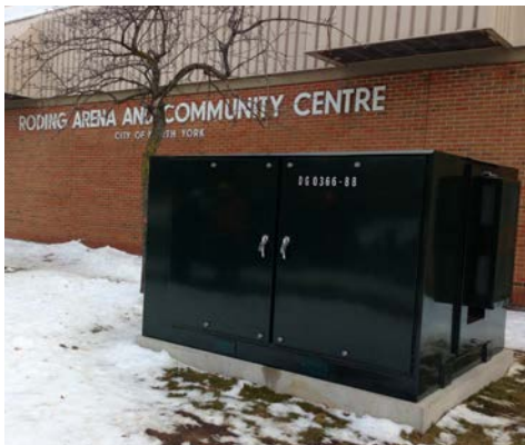
Community energy storage.

Community energy storage (CES) brings together many of the benefits of customer-owned storage with those of utility-scale ownership and operation, and is receiving increasing attention in relation to distributed solar generation (ESA 2014). CES is different from storage associated with individual distributed energy systems, because a CES unit serves all customers connected to a particular distribution area (Roberts 2013; Carlson 2011).