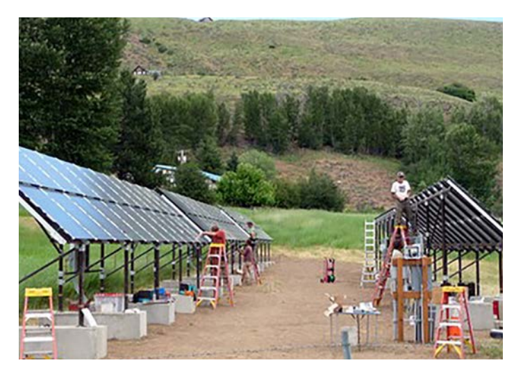
Winthrop Community Solar Project.

Preparing a No-Action Letter Request is a significant cost and time burden on project developers. Projects initiated by community groups, for example, may not have the resources to overcome this barrier. Work is underway, sponsored by the Department of Energy's SunShot Initiative, to bring clarity to the securities issue for shared solar projects at the federal level. However, the Securities Exchange Act of 1934 preserves much of the states' actions with regards to securities.<sup>24</sup> For this reason, state regulators will need to provide similar clarity at the state level.