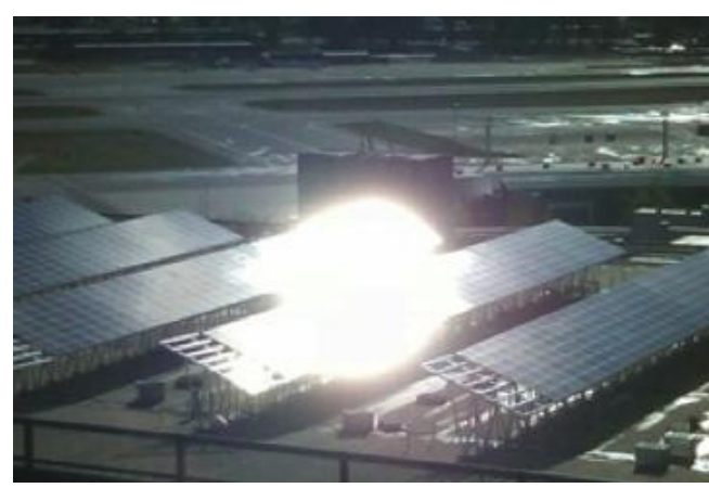
Fig. 2: Solar PV at MHT.

Clifford K. Ho, Cianan A. Sims, and Julius E. Yellowhair from SNL used the SGHAT tool in 2012 to investigate possible solutions, and the results were published in the Solar Glare Hazard Analysis Tool (SGHAT) User's Manual v. 2.0. <sup>46</sup> The study recommended a less reflective PV panel to create a perceptible glare decrease. The report also recommended the panels be rotated 90° to the east, which would point away from the air traffic control tower. Additional possible solutions investigated for the south-facing problem panels included: