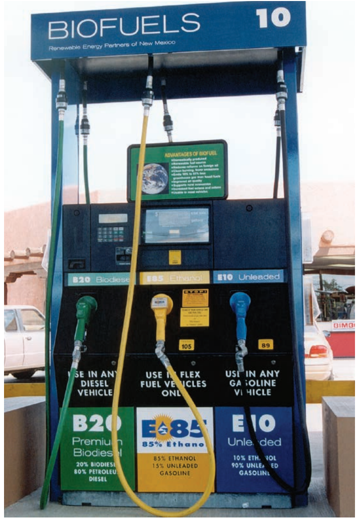
Photo from Charles Bensinger and Renewable Energy Partners of New Mexico, NREL 13531