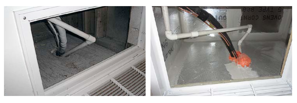
Pre-retrofit: Typical unsealed return plenum (left). Post-retrofit: Return plenum edges and seams are sealed, preventing return air from non-interior spaces, saves energy, and improves indoor air quality (right).