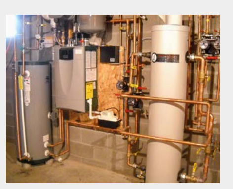
House #3: low-mass, modulating condensing boiler; indirect domestic hot water tank; variable-speed pumps; baseboard convectors. A buffer tank was compared to primary-secondary piping. Constant temperature operation was compared to thermostat setback.

House #2: highmass, modulating, condensing water heater; variablespeed pumps; baseboard convectors; no primarysecondary piping