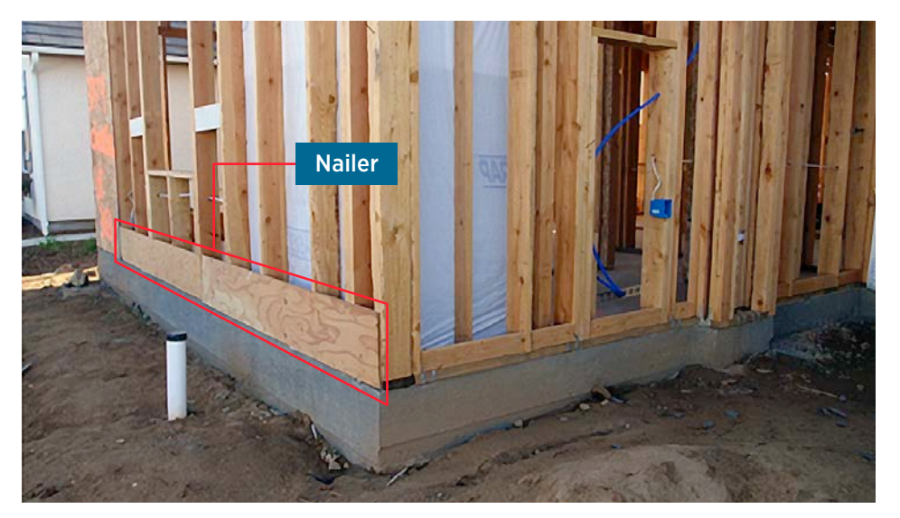
The slab edge of the test house prior to installation of the XPS rigid foam insulation, showing the nailer that supports the foam.

One challenge during installation of the system was the attachment of the butyl flashing to the open framing. To solve this constructability issue, the team added a nailer to the base of the wall to properly attach and lap the flashing. In this strategy, R-7.5, 1.5-in.-thick extruded polystyrene (XPS) was installed on the exterior of the slab for a modeled savings of 4,500 Btu/h on the heating load.