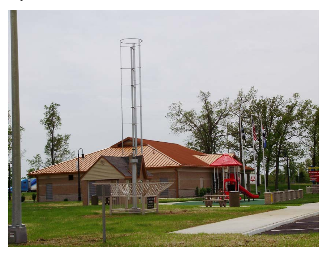
Figure 10. A Windspire vertical-axis wind turbine in the built environment.

There are several methods for modeling and predicting built-environment wind resources. CFD and wind tunnel testing are often cited. Of particular interest are field experiments to study flow in an urban environment in the context of Atmospheric Transport and Dispersion of contaminants.