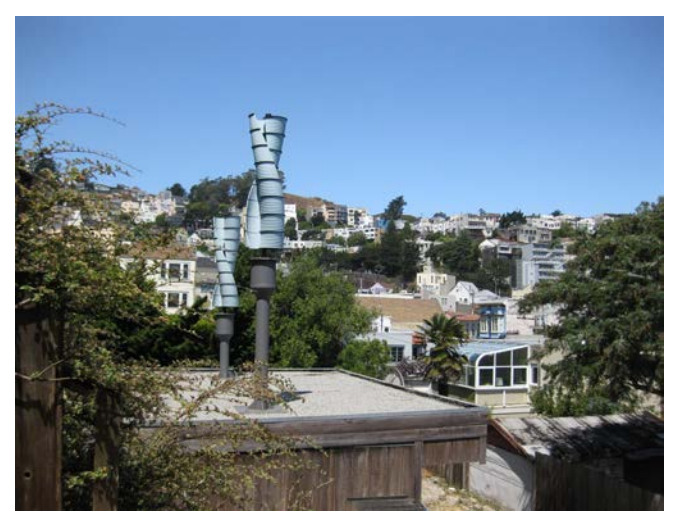
Figure 13. An example of a roof-mounted verticalaxis wind turbine in San Francisco.

A BWT reliability database should provide a central location for logging all BWT failures. By tracking failures, this database could be used to identify issue patterns, minimize repeated similar mistakes, and improve designs and design requirements. This database could be made public, limited access could be granted, or a combination of both could be implemented. It is expected that it will be used by owners, policymakers, installers, and manufacturers. Although each group will have its own database need, the goal is to improve BWTs' safety and quality.