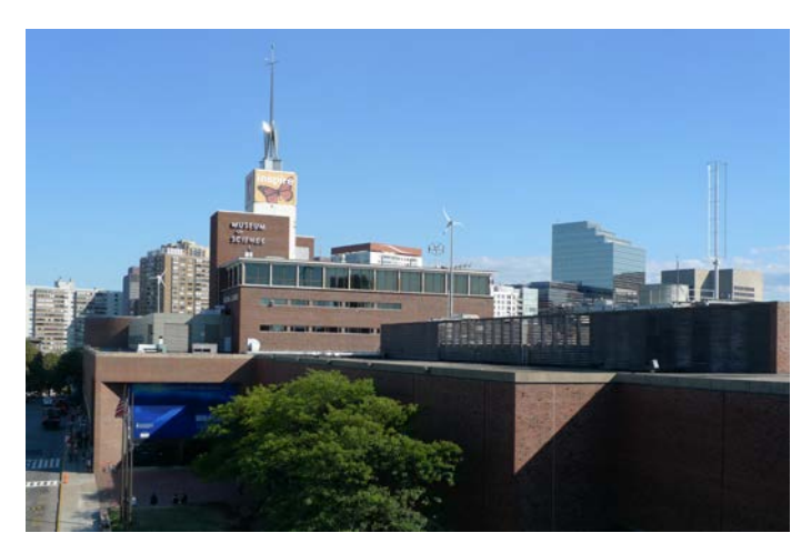
Figure 16. The Boston Museum of Science currently has five turbines in its Wind Turbine Lab.

Southbank University has experience with roof-mounted turbines in central London (Day and Dance 2011).