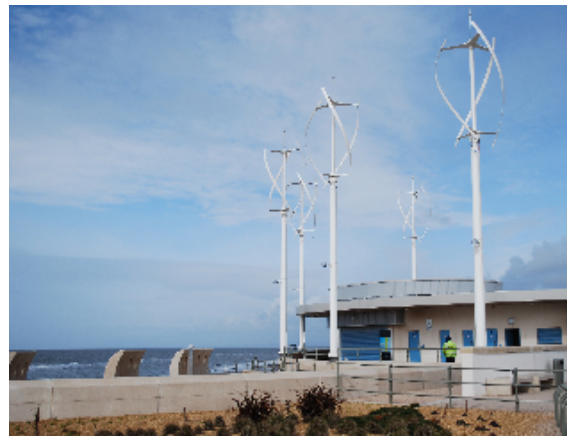
Figure 3. Quiet Revolution vertical-axis wind turbines at Cleveleys Promenade, United Kingdom.

SWTs can be safe and reliable; installing them on towers tall enough to place them well above any nearby obstacles increases production and reduces turbulence-induced loads. In the built environment, the wind resource is more turbulent than conventional locations, which can lead to increased loads. Placing an SWT into a built environment may exceed the design limitations of the SWT and present issues related to safety, durability, and performance.