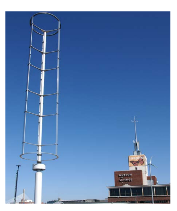
Figure 11. Windspire vertical-axis wind turbine at the Boston Museum of Science.

Cost of energy calculators exist and are widely used; however, they perform poorly in terms of predicting the cost of energy of turbines in complex terrain. Hence, their predictive capability in built environments is highly dubious. The existing cost of energy calculators must be modified and adapted for BWTs.