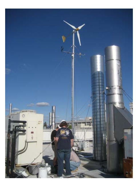
Figure 2. Students at the University of California - Davis work on a roof-mounted Bergey wind turbine.

The poor quality of SWT installations completed without professional consultation is particularly apparent in BWT installations (Encraft 2009). These installations are often located in areas where the wind is blocked or diverted by