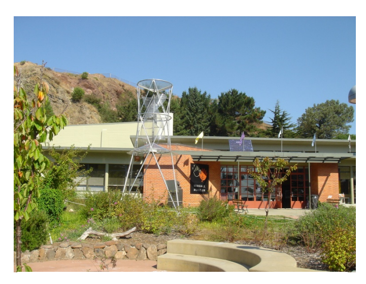
Figure 20. This Aeroturbine at the Randall Museum in San Francisco, California, is an example of a vertical-axis wind turbine in the built environment.

wind turbine placement within the structure. Building-integrated wind turbines are architecturally noteworthy and require extensive engineering expertise and added cost. With most building-integrated wind turbines, issues of aerodynamics, vibration, and building interaction have been studied, and potential effects have been mitigated. Building-integrated wind turbines are custom designed, and their installations typically do not represent Universal Building Code practices that influence structural resonance frequencies. Therefore, this roadmap does not address them.