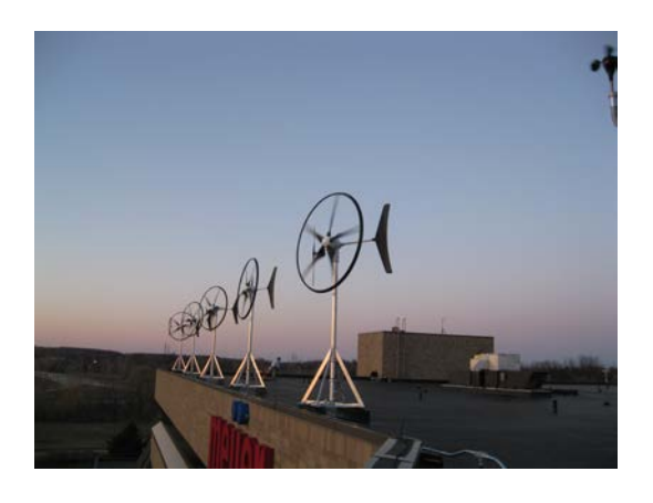
Figure 6. Swift wind turbines at Meijer Inc.'s headquarters in Walker, Michigan.

Turbine technology barriers to BWTs consist of a lack of knowledge as to how the built-environment wind resource affects the turbine. After enough