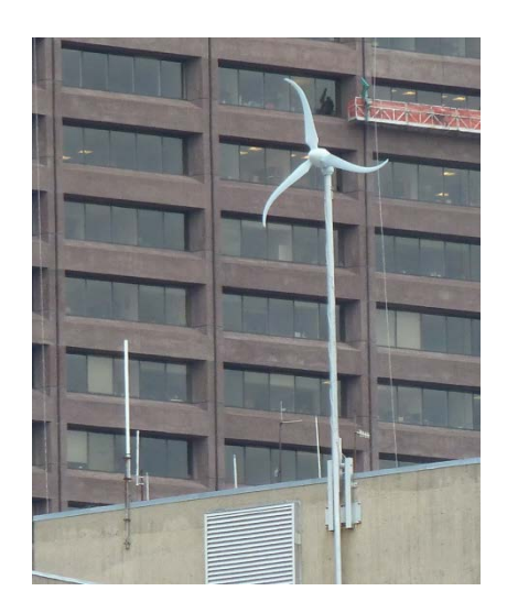
Figure 17. Building-mounted (side) wind turbine at the Boston Museum of Science.