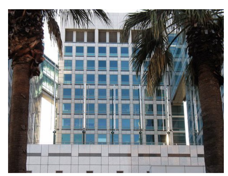
Figure 7. Windspires at Adobe Systems Inc., in San Jose, California.

Proximity to people and property may create additional zoning and permitting issues. If these policies are crafted well, they will reduce hazards to