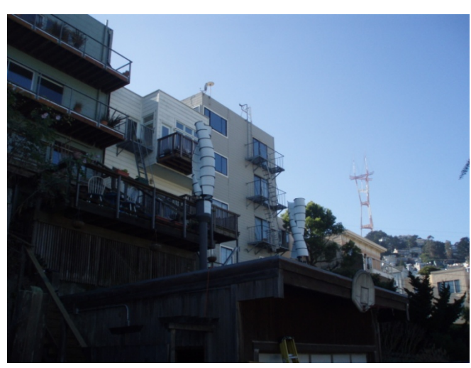
Figure 15. An example of a vertical-axis wind turbine in San Francisco.

The NWTC is also an ideal place for research and development. This is important in researching BWT safety concerns such as fail-safe design, braking redundancy, ice throw and parts-shedding, and shortened turbine life due to high fatigue.