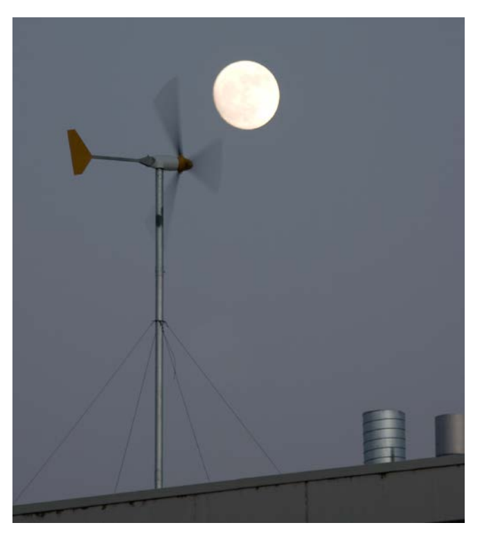
Figure 12. University of California - Davis Bergey wind turbine. The university is conducting BWT research.

Research and development should accelerate the deployment of safe, durable, and effective BWTs. This action can answer specific concerns and develop better methods for future integration. New control methods can be tested to reduce noise and vibrations (reduced noise and vibrations will be important for BWT acceptance). While some research has been conducted on SWT noise reduction, these issues are not as important for rural installations as for built environments, and consequently, much more research is required.