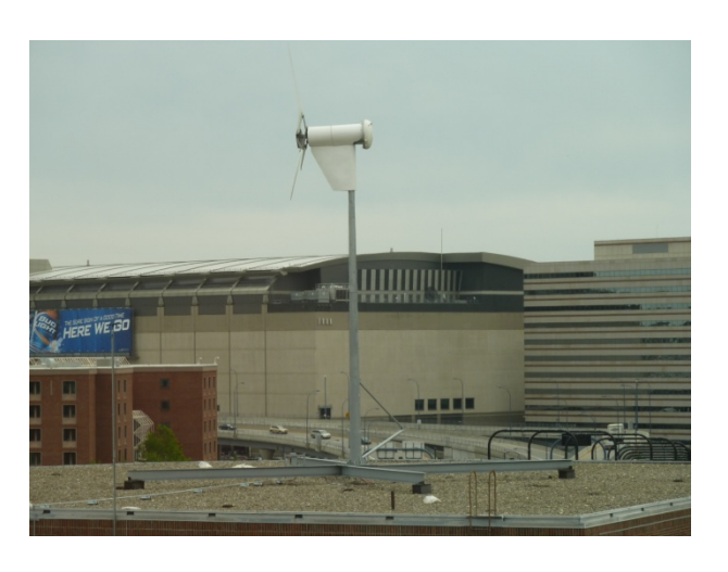
Figure 18. Building-mounted (roof) wind turbine at the Boston Museum of Science.