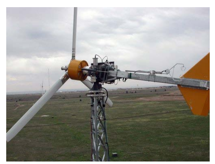
Figure 14. Bergey turbine outfitted with two threedimensional sonic anemometers that measure wind speeds upwind and in the tail wake.

NREL developed the software TurbSim, which simulates the turbulent inflow to a turbine. This