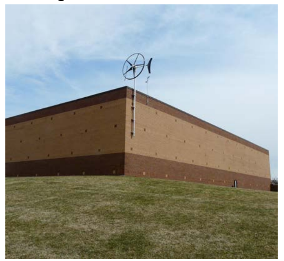
Figure 8. A SWIFT wind turbine at a municipality's Board of Public Works building.

Interest in renewable energy has increased dramatically in the past few years, and many people want to generate their own electric power. Potential benefits need to be weighed against the costs and hazards of BWTs. Little knowledge currently