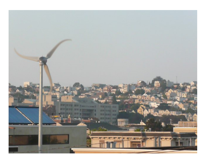
Figure 5. Skystream turbine in San Francisco, California.

Estimates exist for wind speed distributions and profiles in rural environments, but their application to the built environment is not appropriate. Standard models of vertical wind profiles (e.g., the log or power laws) do not apply at BWT locations, and alternative approaches are needed for predicting the wind fields above buildings at BWT heights (Beller 2011). Additionally, in the rural environment, the wind distribution is approximately twodimensional: The wind increases with height, but the vertical component to the wind is limited (the IEC standard requires up to 8 deg vertical inflow)