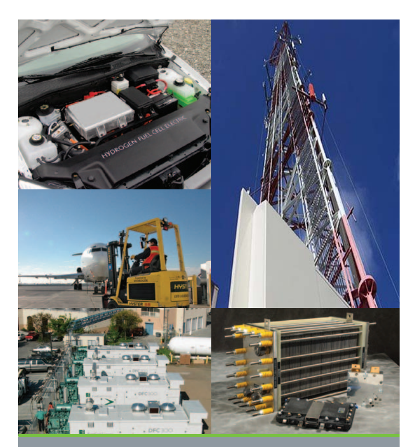
Recovery Act-funded fuel cells are providing clean, efficient, and reliable power for many applications, including auxiliary power, material handling equipment, backup power, and portable power. Photos, clockwise from top left: NREL/PIX 14836; Photo courtesy ReliOn NREL/PIX 16642; NREL/PIX 15987; NREL/PIX 16602; NREL/PIX 12508

Fuel cells powering light-duty vehicles provide the greatest petroleum reduction and environmental benefits. However, they also face challenges, including the need to reduce cost and increase durability; to develop lightweight, compact fuel storage systems; to invest significantly in a hydrogen fueling infrastructure; and to develop large-scale manufacturing capability.