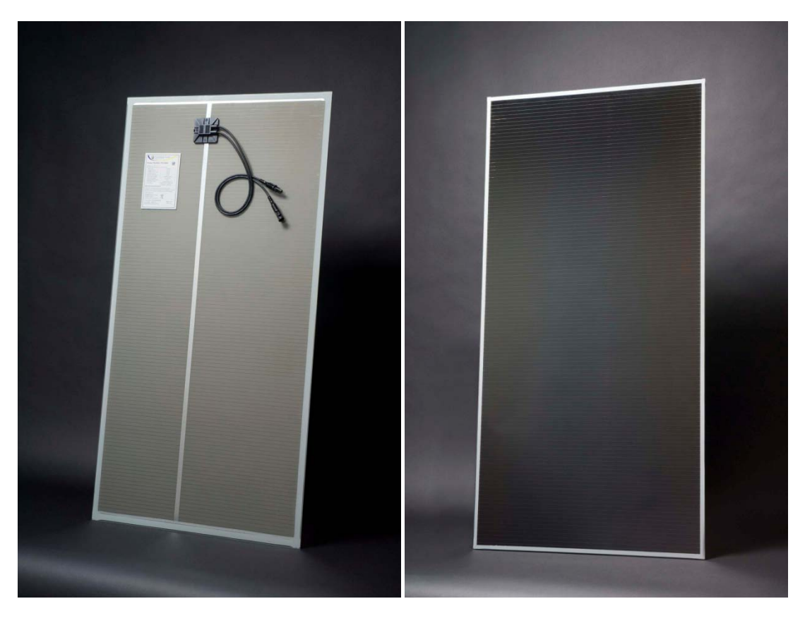
Figure 6. 60cmx120cm pilot module product.