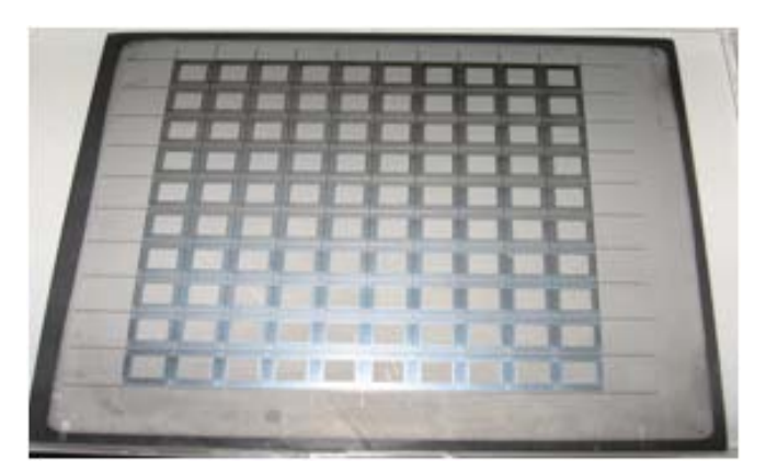
Figure 1. Array of CdTe PV cells on 6"x6" substrate

Using a laser scribing process sequence similar to that used for thin film module cell interconnects, the substrate films were divided into a 10x10 array of PV cells that were 0.71 \text{cmx} 0.71 \text{cm} (0.5 \text{cm}^2) each. An automated JV testing instrument was developed to facilitate the evaluation of each substrate. The picture below shows a 6"x6" substrate with a completed 10x10 array of CdTe PV solar cells.