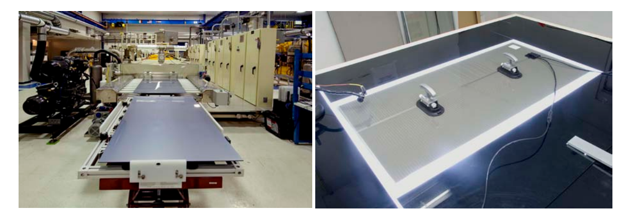
Figure 5. CdTe process equipment exit and a completed module in J-V testing.

commissioned pilot line was verified by Harin Ullal, NREL Technical Monitor, during a visit to the pilot facility, November 6, 2008. This deliverable T5-D1 was completed ahead of the December 26, 2008 deliverable deadline. Pictures of the CdTe process equipment exit and a completed module in J-V testing are shown below.