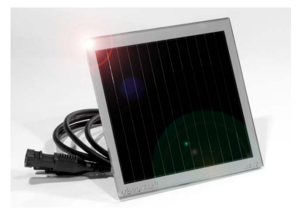
Figure 2. 6"x6" prototype mini-module (Front View)

Completed working 6"x6" prototype mini-modules are shown in the two pictures below: