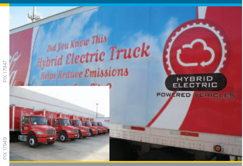
Coca-Cola Refreshments operates hybrid-electric and conventional diesel delivery trucks from its Miami/South Dade depot.

This project is part of a series of evaluations performed by NREL's Fleet Test and Evaluation Team for the U.S. Department of Energy's Advanced Vehicle Testing Activity (AVTA). AVTA bridges the gap between research and development and the commercial availability of advanced vehicle technologies that reduce petroleum use and improve air quality in the United States. The main objective of AVTA projects is to provide comprehensive, unbiased evaluations of advanced vehicle technologies in commercial use. Data are collected and analyzed for operation, maintenance, performance, costs, and emissions characteristics of advanced-technology fleets and comparable conventional-technology fleets operating at the same site. AVTA evaluations enable fleet owners and operators to make informed vehicle-purchasing decisions.