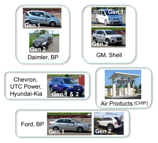
Figure 2: U.S. Learning Demonstration industry partners

The Learning Demonstration fleet is made up of vehicles from four project teams, as indicated in Figure 2.