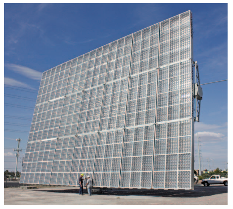
The Amonix 7700 Solar Power Generator produces more electricity on less land than any other commercially available PV system.

Its utility-scale size reflects its desired impact on the energy grid: reducing costs and land use. The Amonix 7700 is a game-changer in propelling solar electricity to grid parity with fossil fuels.