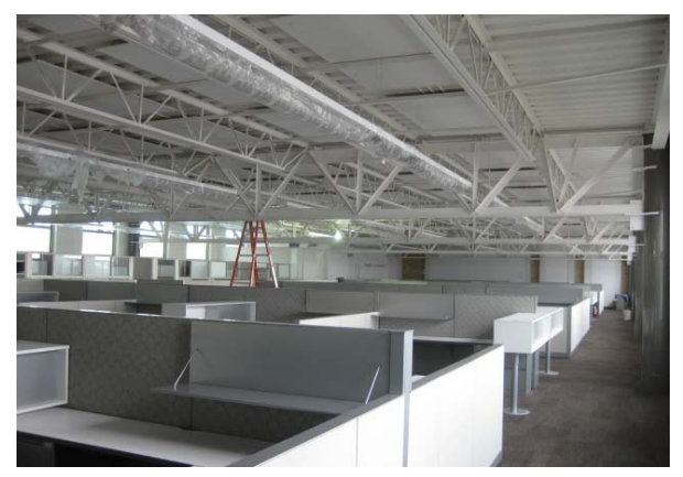
Figure 5: RSF Construction Photo

owner turnover in June of 2010, and during that time we expect to gain some additional insight about simulation's quantitative predictive capability.