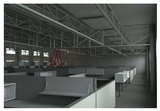
Figure 6: RSF Radiance Rendering