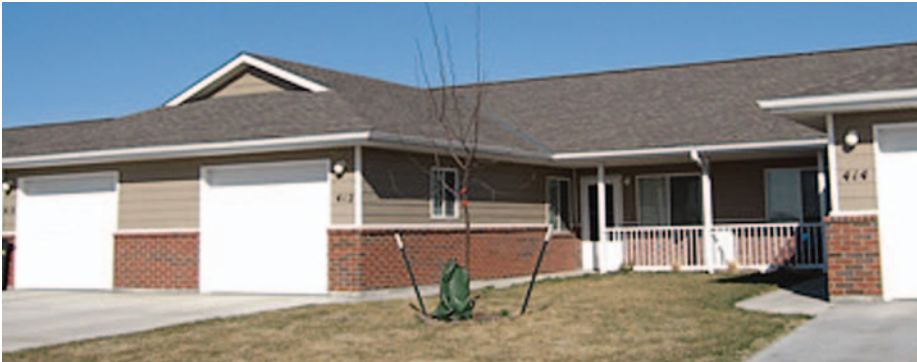
Mason Earles/PIX 16644

model “green” community. New homes will use 40% to 50% less energy than current building code. Renovated homes will use 25% less energy than current building code. Greensburg’s green housing projects include: