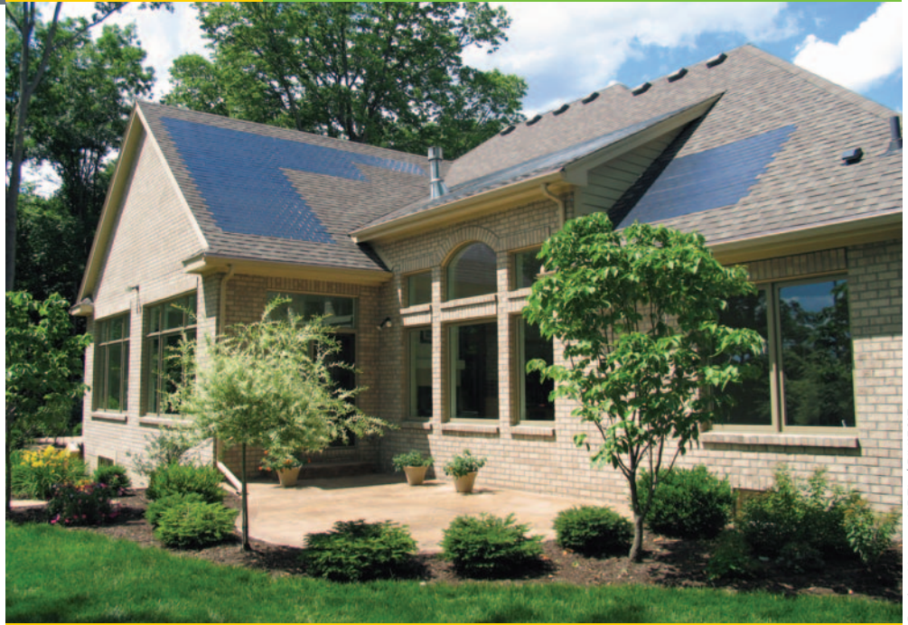
Decker Homes, NREL / PIX15617

Green homes encourage the use of renewable energy, which can reduce your home's impact on the environment because it is the cleanest form of energy around. A variety of renewable technologies are available, including small wind energy systems, geothermal heating and cooling, and solar energy systems used to produce electricity and heat water. The most common form of renewable energy used by homeowners is solar energy, which is often financed with a home mortgage. In areas with frequent storms or after a natural disaster, renewable energy can provide emergency power if batteries are integrated into the system.