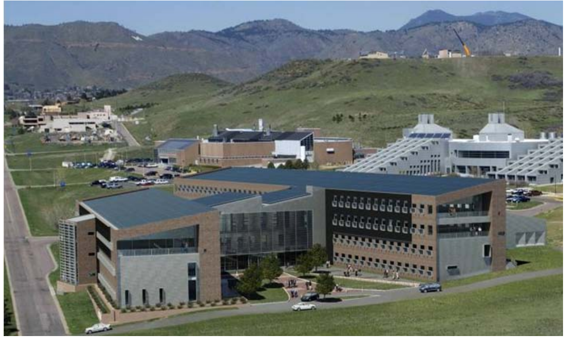
NREL PIX 16277

models, and encouraged the design team to identify efficiency strategies in the purchasing, control, and operations of the plug and process loads.