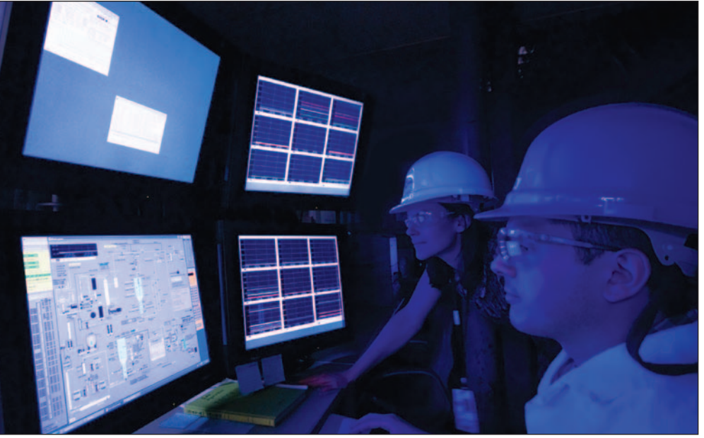
The Thermochemical Users Facility (TCUF) is equipped with sophisticated data monitoring and operation control systems. This control room simultaneously monitors all key operating parameters.

exploring direct-catalytic upgrading of pyrolysis oil to finished fuels.