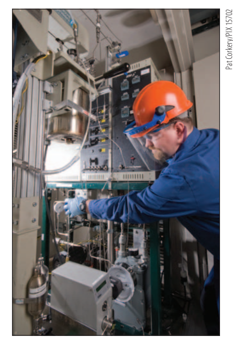
Catalytic fuels synthesis unit converts syngas to liquid fuels such as methanol and mixed alcohols.

The Molecular Beam Mass Spectrometer (MBMS) analyzes vapors during the gasification and pyrolysis processes.