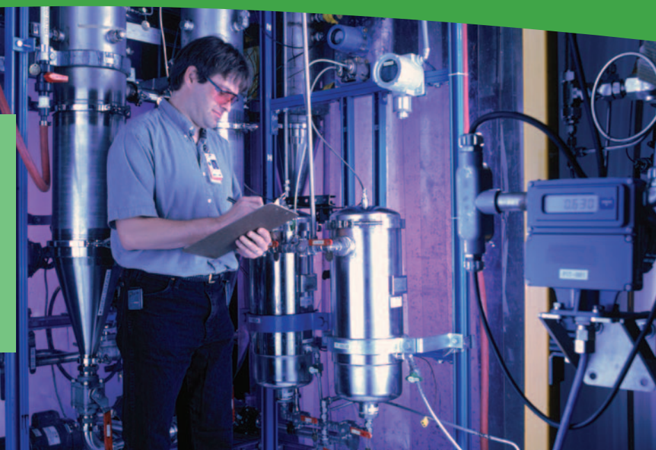
The scrubbers on the TCPDU are used to remove the steam and condensable tars from the synthesis gas.

Thermochemical Process Development Unit Researching Fuels from Biomass