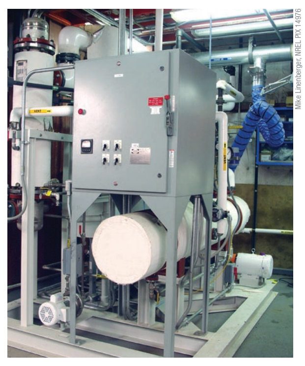
This evaporation system concentrates sugar-rich streams or removes volatile compounds.