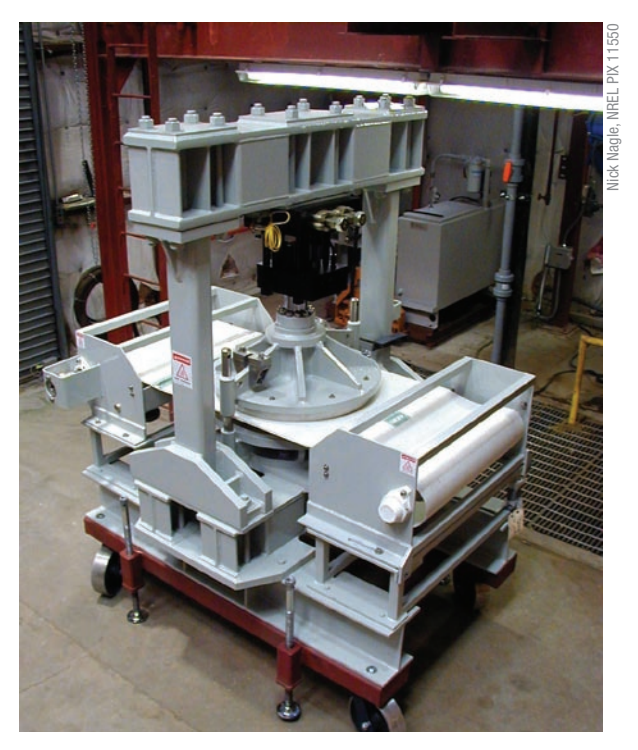
With this pressurized filter press system, researchers can separate liquid hydrolyzate from the remaining solids at high temperature using NREL's patented hot-wash process.