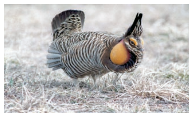
The Grassland Shrub Steppe Species Collaborative – a 4-year effort to study the impact of wind turbines on prairie chicken habitats in Kansas, is one study being conducted with program support to help understand wind-wildlife interactions.