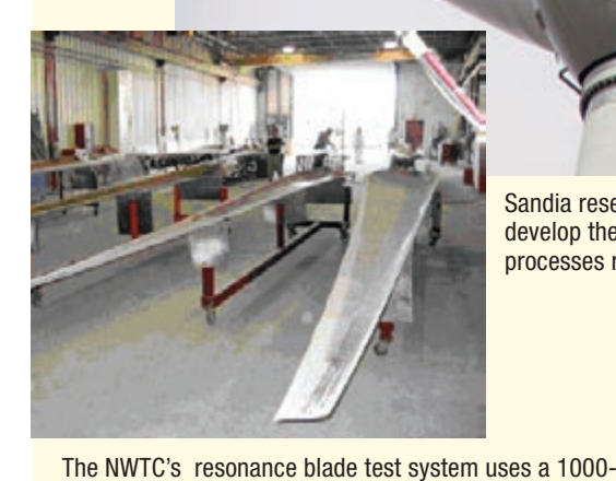
Sandia researchers work with industry partners to develop the advanced materials and manufacturing processes required by longer blades.

Sandia National Laboratories developed an advanced data acquisition system (ATLAS II) on a GE Wind 1.5-MW wind turbine. The turbine is part of a cooperative activity involving SNL, GE Wind, and NREL.