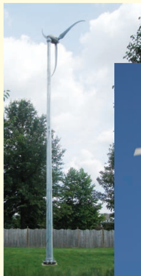
Southwest Windpower's 1.8-kW Skystream turbine.

Windward Engineering produced a new 4.25-kW machine called the Endurance. The turbine is sized to offset the energy consumption of an average U.S. home (~11,000 kWh/yr) when installed in a Class 3 wind regime (5 m/s at a height of 10m). It employs an induction generator to simplify grid compatibility and a brake that is capable of stopping the rotor on command in any wind condition—a unique feature for a small wind system. Windward used off-the-shelf components from other industries to reduce system cost. The Endurance is currently being tested at the NWTC to IEC standards for duration, power performance, and acoustics.