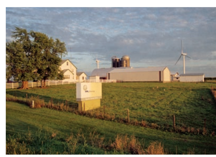
The new wind generating capacity installed in 2006 (2,454 MW) represents $5 to $9 million in annual payments to rural landowners.

The United States is home to more than 700 Native American tribes located on 96 million acres (39 million hectares), much of which have excellent wind resources that could be commercially