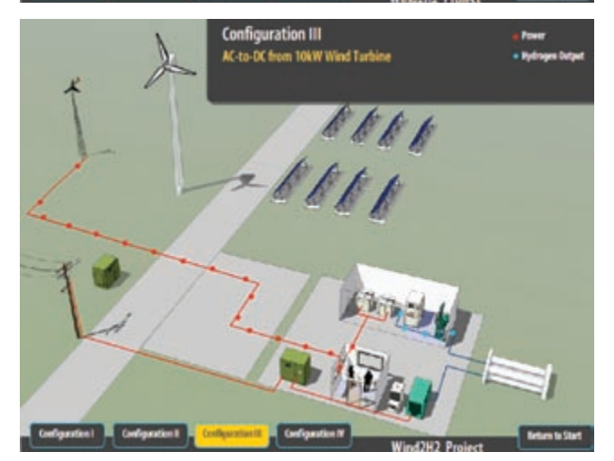
This wind-to-hydrogen animation at http://www.nrel.gov/ hydrogen/proj_wind_hydrogen.html demonstrates how electricity from wind turbines is used to produce hydrogen at NREL's National Wind Technology Center.