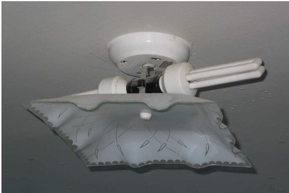
Figure 2. Photograph of compact fluorescent light bulbs installed in an incandescent fixture. The original diffuser for the bulbs was flipped upside down to make room for the longer bulbs. In the inverted configuration, the diffuser is not as attractive, and it is not very effective because the bulbs protrude. This bulb did well in an entry market—appealing to consumers who wanted to conserve energy—and performing very well, but it was not a long-term success. This style of CFL bulb is no longer widely available, most likely for the obvious reason.

Certain individuals are always willing to try a new technology, no matter what it looks like. And other people are willing to be significantly inconvenienced—either financially or in terms of personal effort—if they can save energy. These individuals help companies introduce new technologies. Early marketing of compact fluorescent light (CFL) bulbs was successful by identifying consumers interested in conserving electricity. For example, my family heard of an early opportunity to buy CFL bulbs through information provided by the Solar Energy Research Institute. We bought quite a number of these bulbs and discovered that some fit easily into fixtures, whereas others did not (see Fig. 2). I am quite confident that other customers had similar experiences with the bulbs because now when I go to the store, the newer CFL bulbs have more appropriate shapes. In the case of CFL bulbs, these entry markets were effective at helping the industry get product into the market, determining the version of the technology that would appeal to the average consumer, then mass marketing the more mature version of the product.