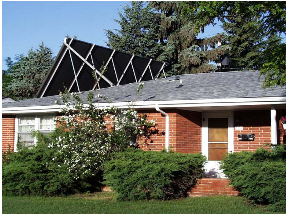
Figure 3. The solar panels on this house may be attractive to this homeowner because of their functionality. But anecdotal evidence shows that such panels are not always considered an asset when it comes time to sell a house. Nevertheless, marketing of products into entry markets such as this provides a very valuable role in the overall development of a technology.

Because the replacement of lighting fixtures occurs over more than a decade, the quickest way for efficient LEDs to reduce electricity consumption is to identify an efficient screw-in bulb to replace incandescent bulbs. However, this approach has two problems: 1) a high-wattage light bulb can be made for pennies, whereas it takes many dollars to manufacture enough LEDs to emit a comparable level of lighting; and 2) creating a replacement bulb ignores the potential of solid-state lighting, while getting snagged on the technological hurdle of handling the waste heat generated by an LED replacement bulb.