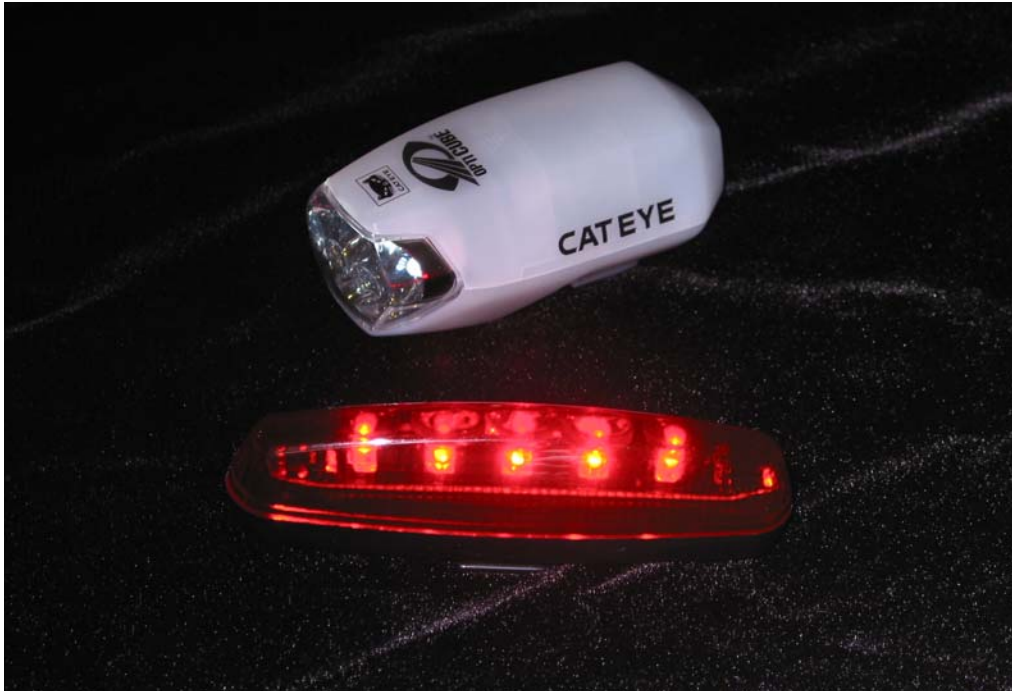
Figure 6. Photo of LED headlight and taillight, made for use on a bike. These are examples of attractive LED applications that have helped to boost sales of LEDs. However, new products must be created to enter the solid-state lighting market. The entry markets for solar cells in consumer products were easier than introducing solar cells into the solar electricity (utility) market. Likewise, identifying entry markets for LEDs in consumer products is easier than identifying the path for entry of solid-state lighting products into the general illumination market.

Forming new partnerships is critical to creating these attractive new products. In the PV industry, PowerLight is one of the most successful American companies. Founded in 1991, PowerLight used a business model that focused on integrating solar panels into building materials and installing them on large buildings. When buying a solar roof, customers benefit by avoiding the cost of the regular roof, and, in some cases, by reducing air-conditioning loads because of the added insulation built into the solar roof. Before PowerLight existed, one could buy solar panels from PV companies and insulation from insulation companies, but few contractors were willing to combine these individual products into a waterproof roof. Selling into a subsidized solar rooftop market in California, PowerLight has grown dramatically and is one of the fastest growing, privately owned PV companies, with offices worldwide.