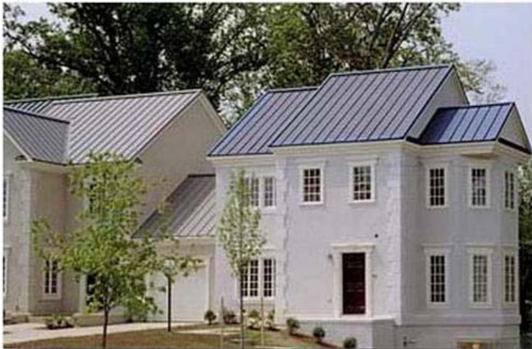
Figure 5. This 1.5-kW solar roof appears almost identical to conventional roofing material.