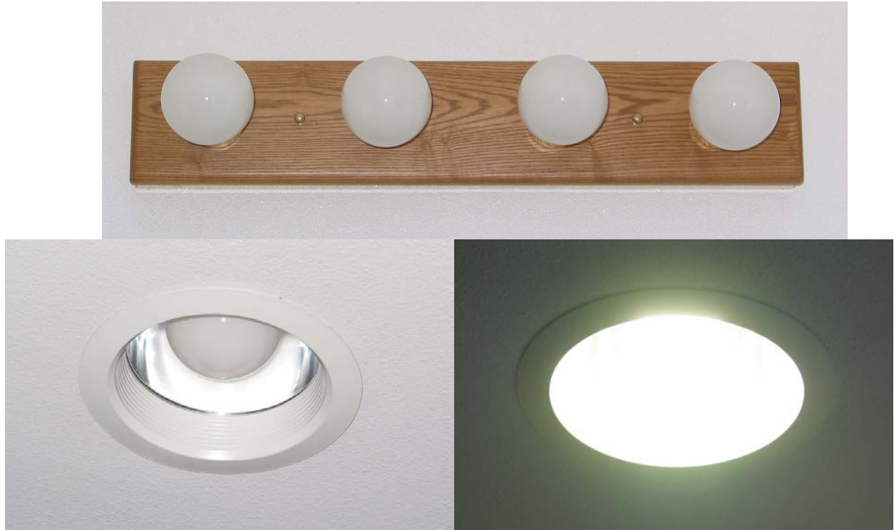
Figure 4. Newer CFL bulbs have the same size and shape as the incandescent bulbs they were designed to replace, as shown by the vanity bulbs in the top photograph. In the lower left photograph, a CFL vanity bulb was placed in a lighting can in the ceiling, providing a light that is attractive (if a can is attractive), as well as efficient. On the lower right, a CFL bulb provides efficient lighting without the awkward protrusion seen in Fig. 2.