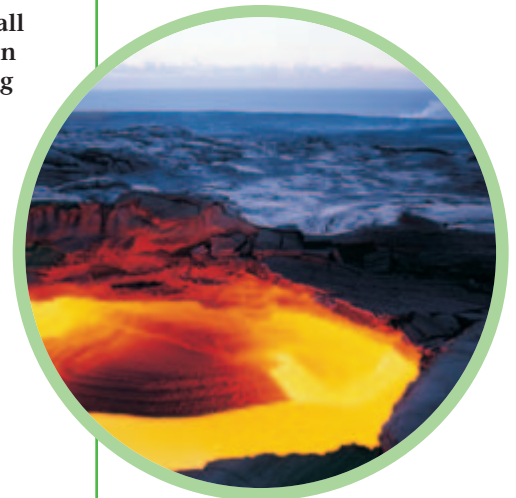
A volcanic vent on the Big Island, Hawaii.

Energy efficiency and clean, renewable energy will mean a stronger economy, a cleaner environment, and greater energy independence for America. Working with a wide array of state, community, industry, and university partners, the U.S. Department of Energy's Office of Energy Efficiency and Renewable Energy invests in a diverse portfolio of energy technologies.