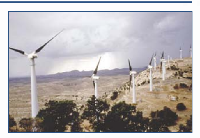
The Texas General Land Office granted permission for Texas' first commercial wind energy farm to be built on state lands in the Delaware Mountains in West Texas. This project has added more than half a million dollars to the Permanent School Fund for use in Texas schools.

$200,000/year in property taxes, or 50% of the county's budget (20 MW)