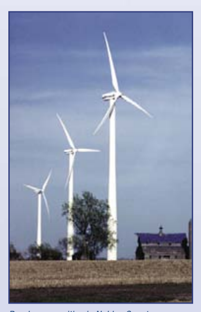
Rural communities in Nobles County, Minnesota, plan to sell their excess wind energy.