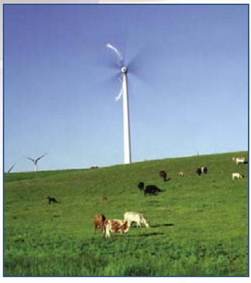
Wind turbines have a small footprint, so crops can be grown and livestock can be grazed right up to the base of the turbine.

Wind turbines have a minimal effect on farming and ranching operations. The turbines have a small footprint, so crops can be grown and livestock can be grazed right up to the base of the turbine. As Leroy Ratzlaff, a third-generation landowner and farmer in Hyde County, South Dakota, said, "It's almost like renting out my farm and still having it. And the cows don't seem to mind a bit."