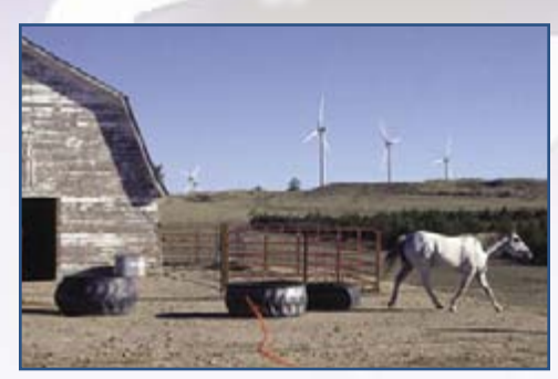
The Municipal Energy Agency of Nebraska (MEAN) owns and purchases the power from this new 10.5-MW project near Kimball.

On a summer day in Nebraska in 2003, 109 people participated in an 8-hour special survey that yielded startling results. More than 60% of the survey participants traveled more than 100 miles to voice their opinions on electricity-generating options to the Nebraska Public Power District (NPPD).