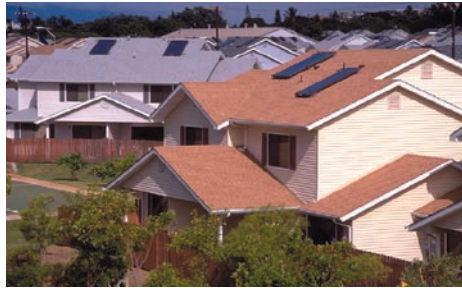
Hawaii Electric Company, Inc.

Hawaii has combined SEP funds with contributions from its partners in the construction industry, building trades, and county agencies to develop an