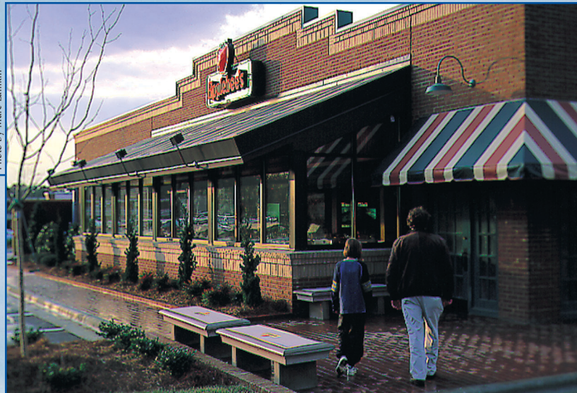
Applebee’s Restaurant in hurricane-prone NORTH CAROLINA incorporates a roof-integrated photovoltaic system that reduces peak energy demand and associated utility costs.