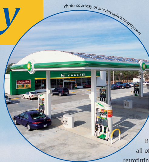
This flat-roof photovoltaic system installed on the canopy on this service station in GEORGIA generates enough energy to power pumping equipment and lighting under the canopy. BP Solar is using solar power on all of its new gas stations and retrofitting existing stations. The first 200 were completed in 2000.