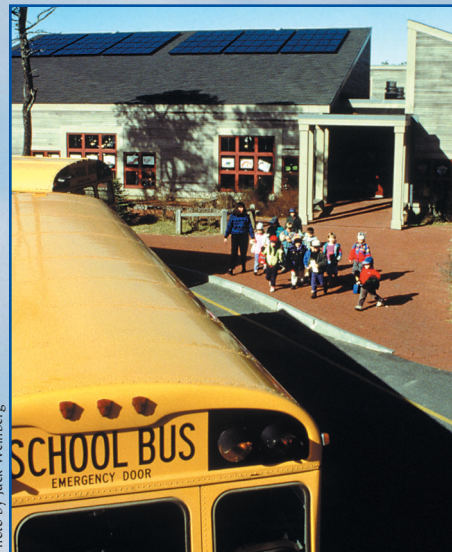
Besides saving energy, the photovoltaic system at this MASSACHUSETTS elementary school provides an excellent teaching tool.