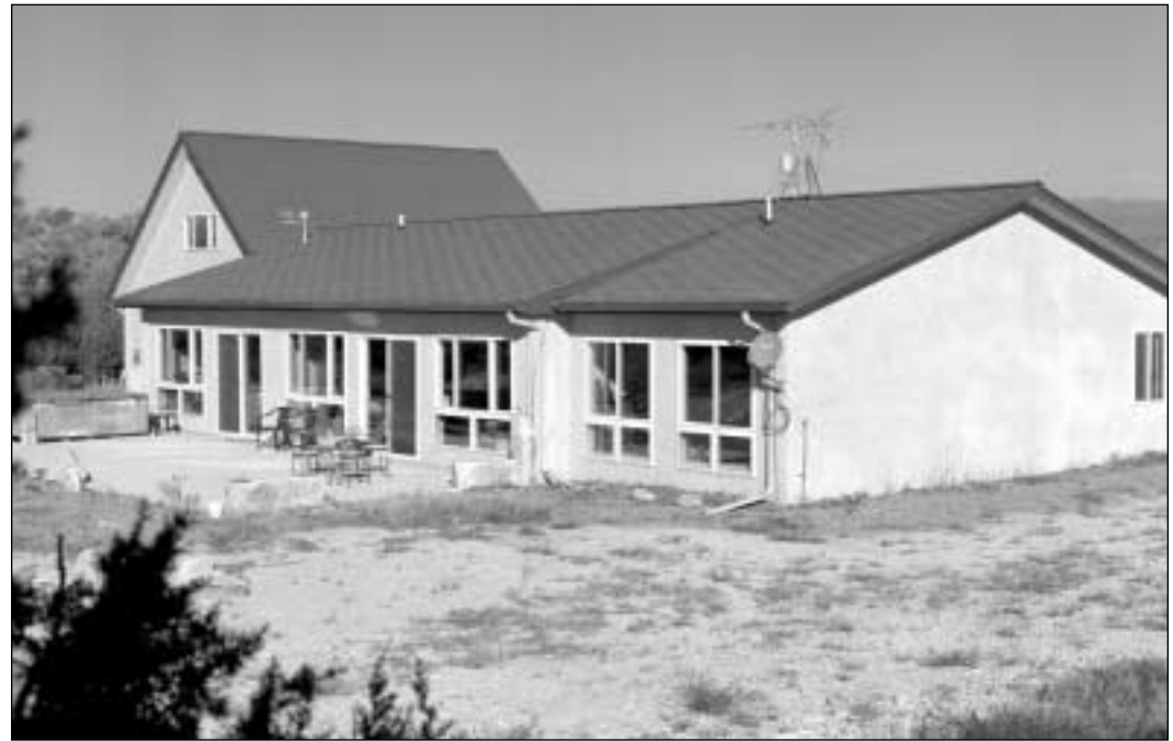
This passive solar home in Pueblo, Colorado — made from concrete forms, a high thermal mass material — only cost about 10 percent more to build than similar, conventional homes in the area.

tain good indoor air quality. A heat-recovery ventilator (HRV) is often the best choice to conserve the home's hard-won solar heat. An HRV takes heat from the departing indoor air and transfers this heat to the entering outdoor air.