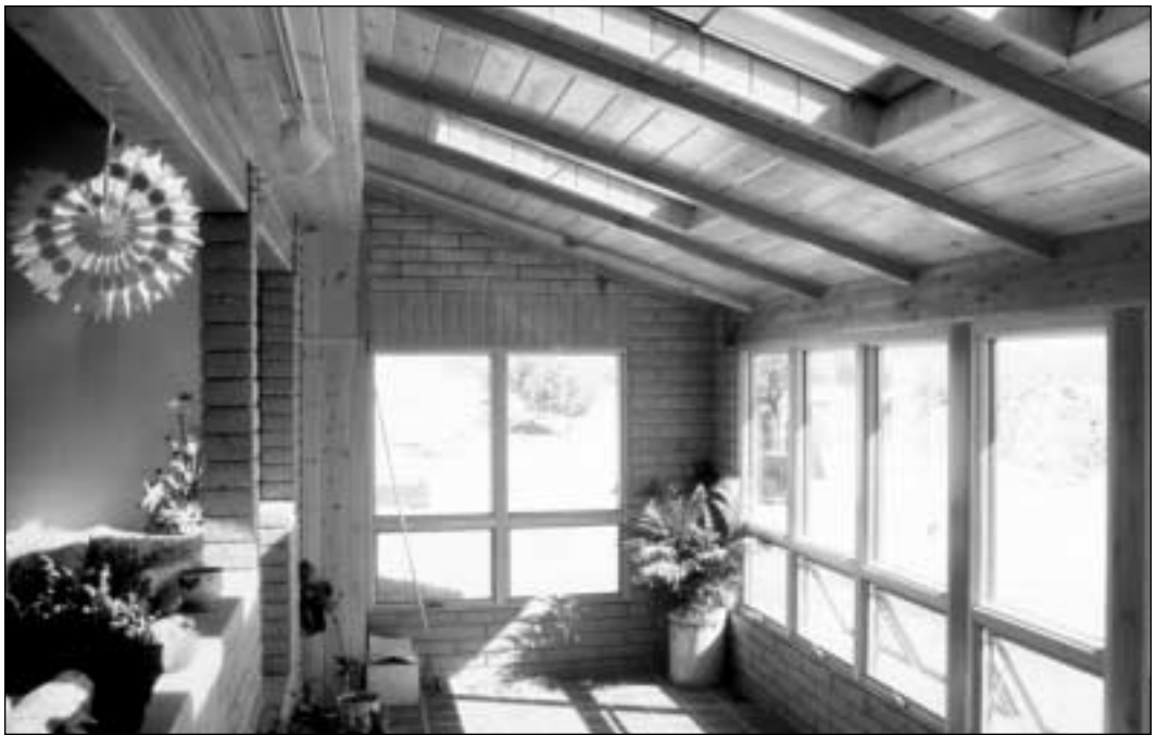
A sunspace within a home in Minden, Nevada.

Most successful passive solar homes are very airtight. As a result, they may require mechanical ventilation systems to main-